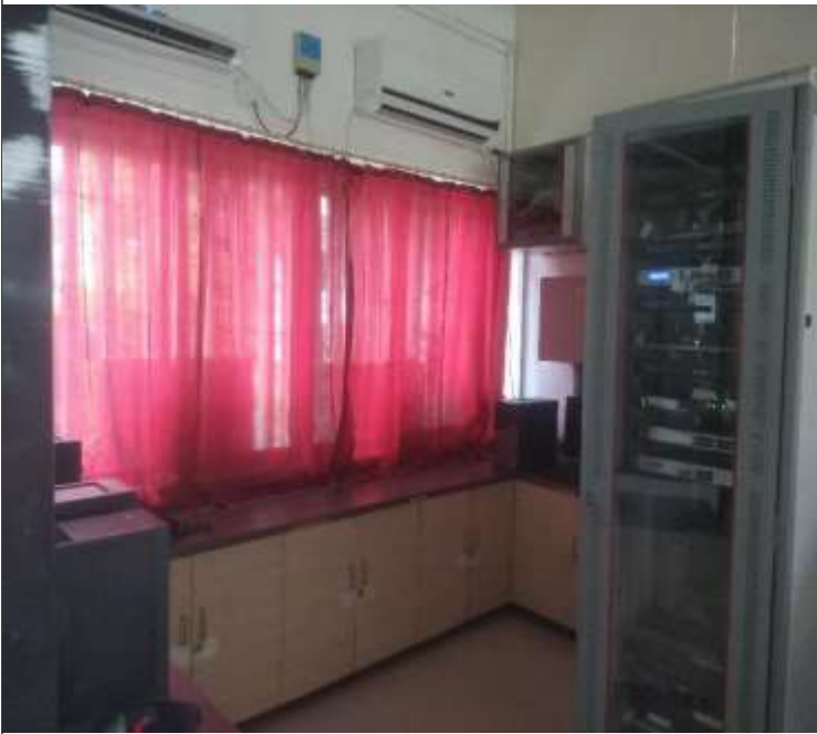
Computer Center Lab & Server Room Layout: