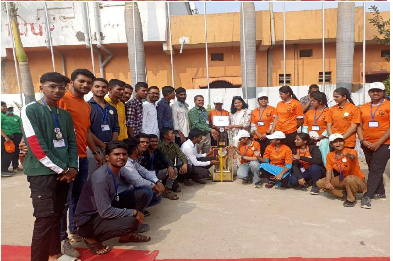
Participation of NSS students from various colleges of Nashik