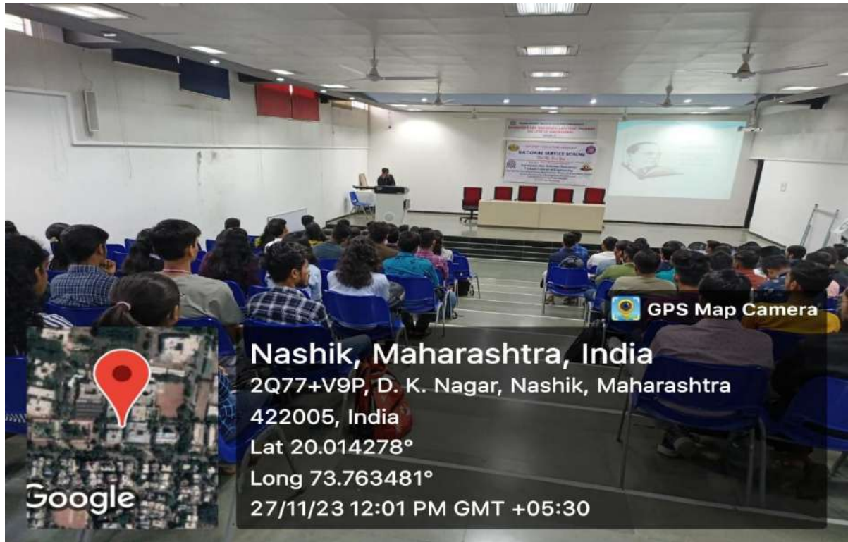
Student's participated Constitutional day