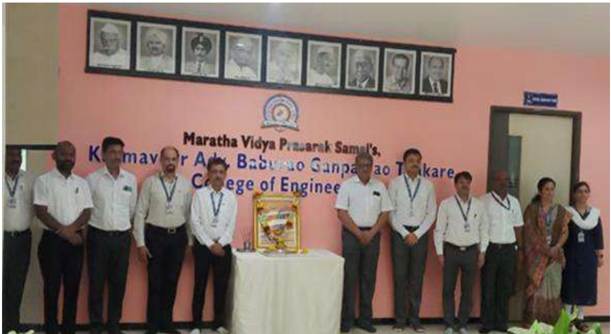
'Shivarajyabhishek Day' was celebrated by worshipping the image of Chhatrapati Shivaji Maharaj