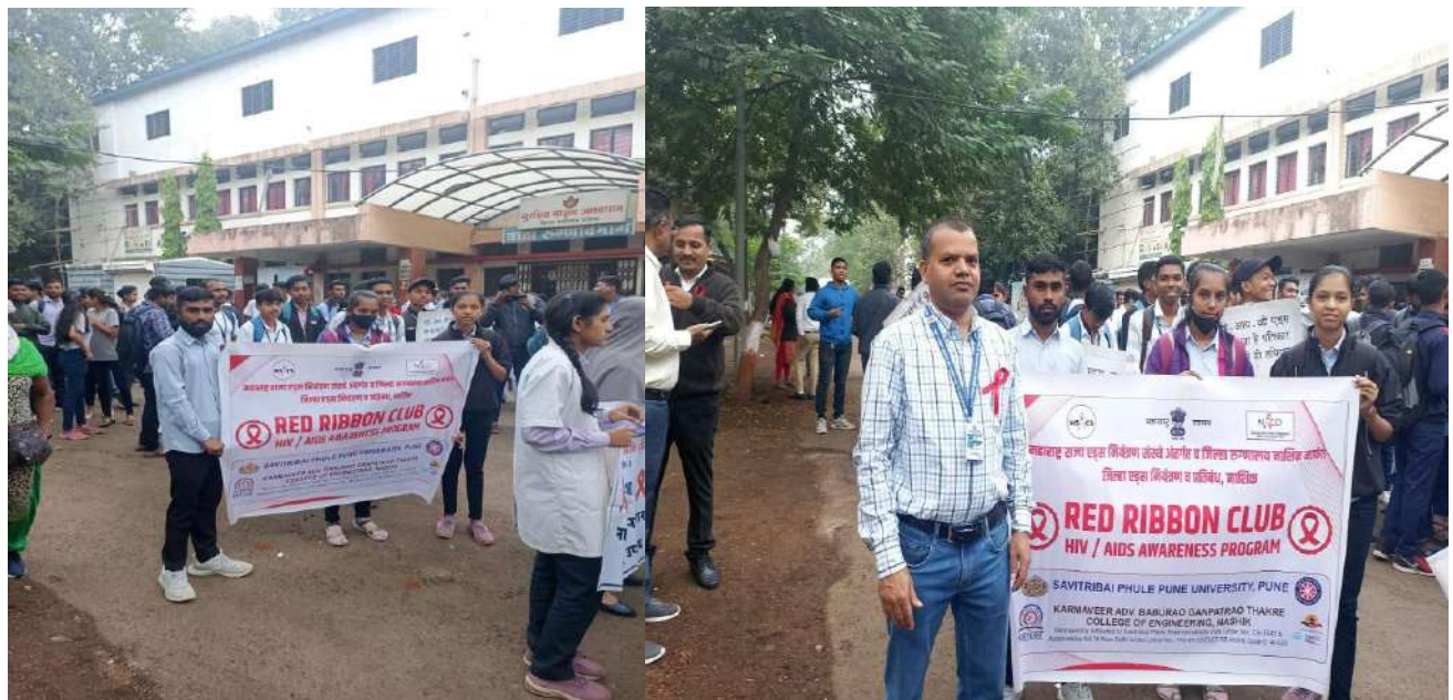
Students Participant for Awareness AIDS rally from Civil Hospital to Collector Office Nash