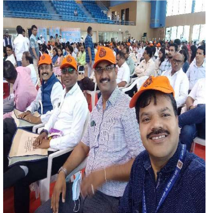
G-20 meeting @ SPPU Pune