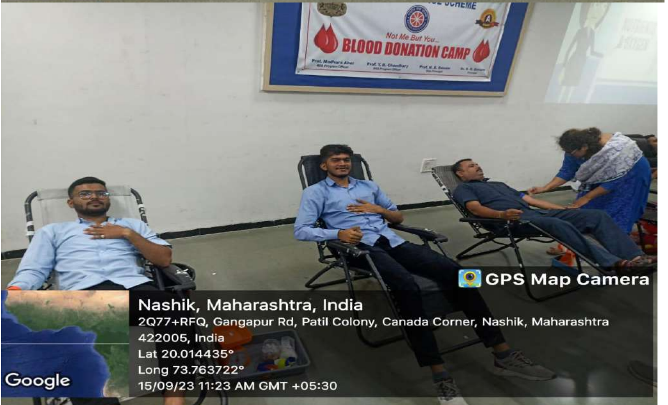
Staff and students donated blood on the occasion of Engineer's Day.