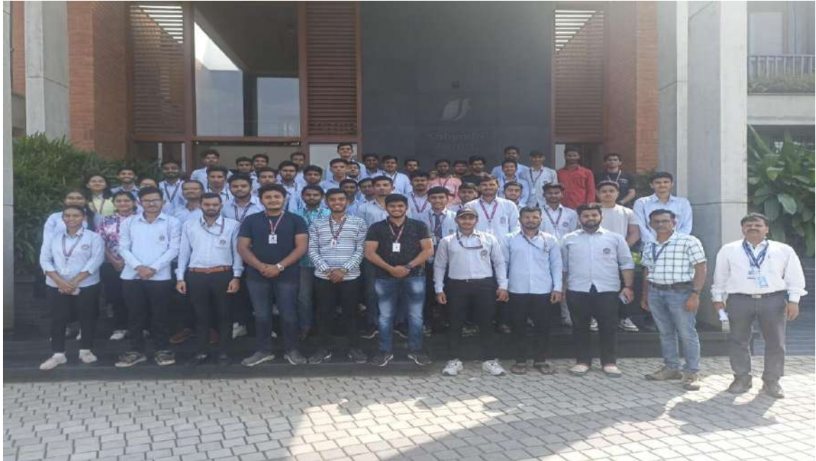
Student participant for NSS day Celebration