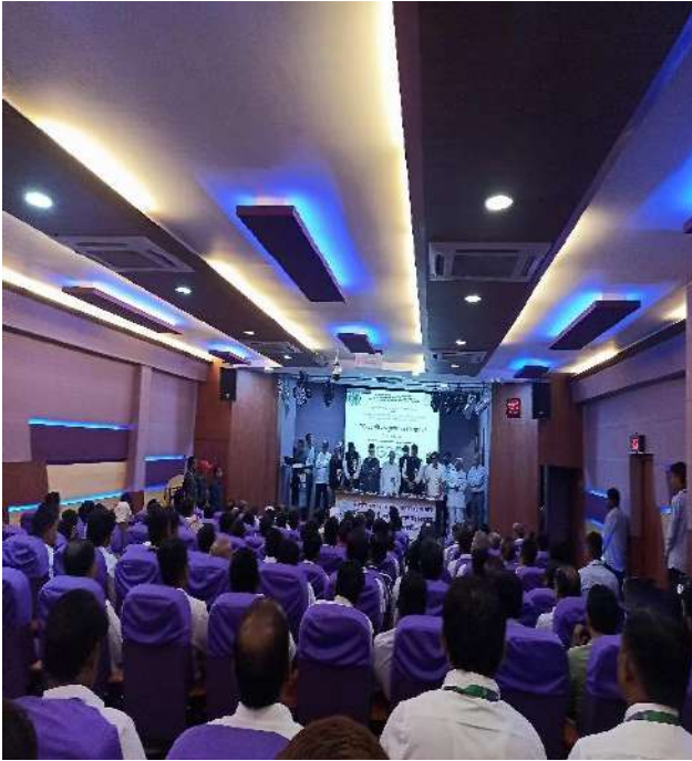
Participated G-20 meeting @ Chandwad