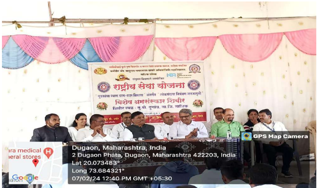
NSS Inauguration Function at Dughav