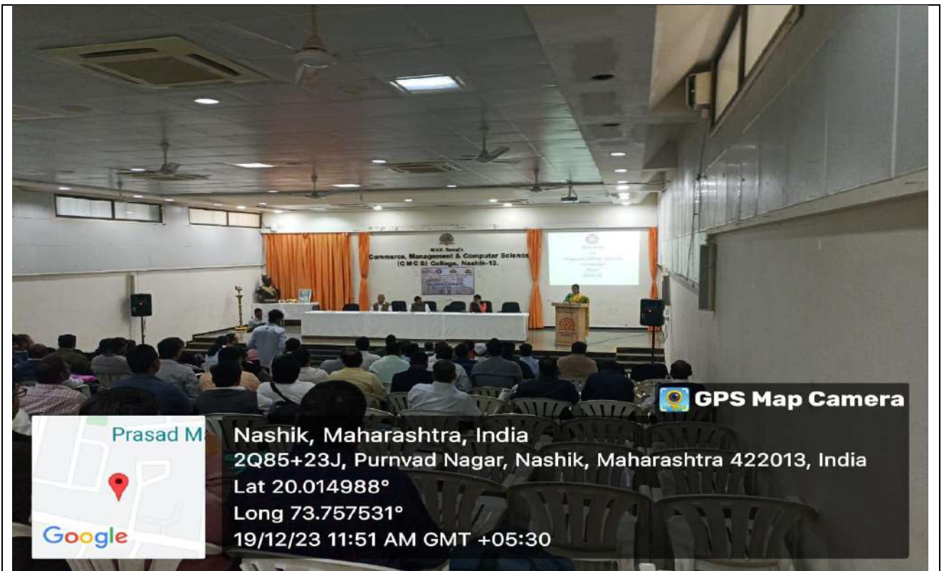
Program officer special meeting for submit audit report of 2022-23 at CMCS college Nashik