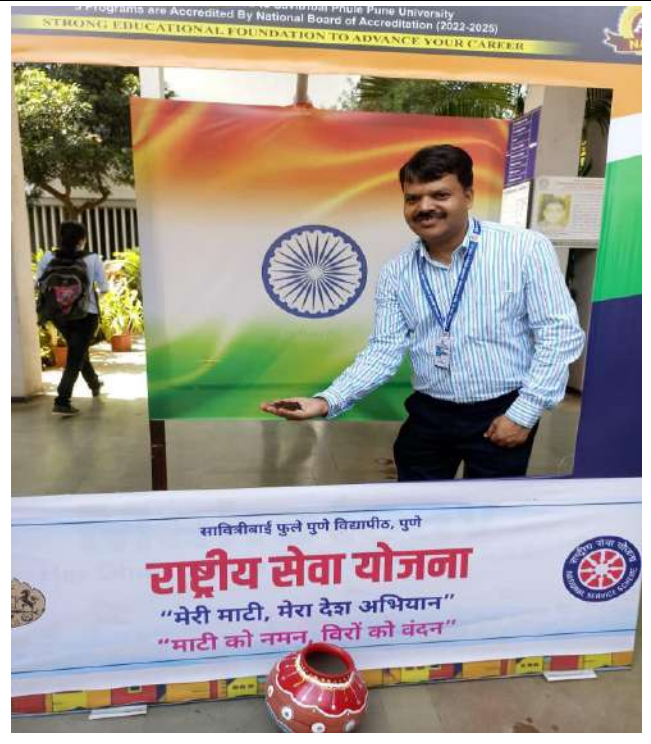
Student and staff participated in Meri Mati mera Desh