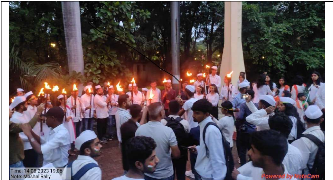
Students and program officers were present for the Yuva Savtantra Jyot (युवा स्वातंत्र्य ज्योत) at Marathan Chouk Nashik