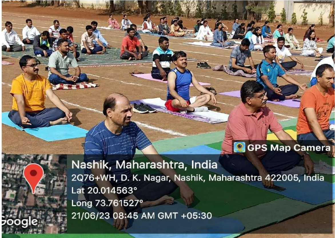
Staff & students are participated for International Yoga day