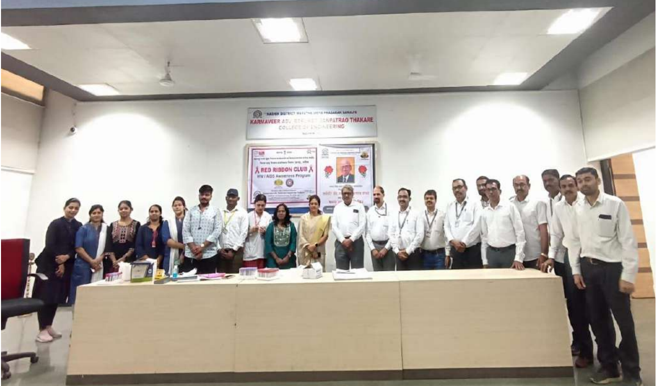
The student staff participated in the blood test camp organized on the death anniversary of Karmaveer Adv. Baburao Ganpatrao Thakare.