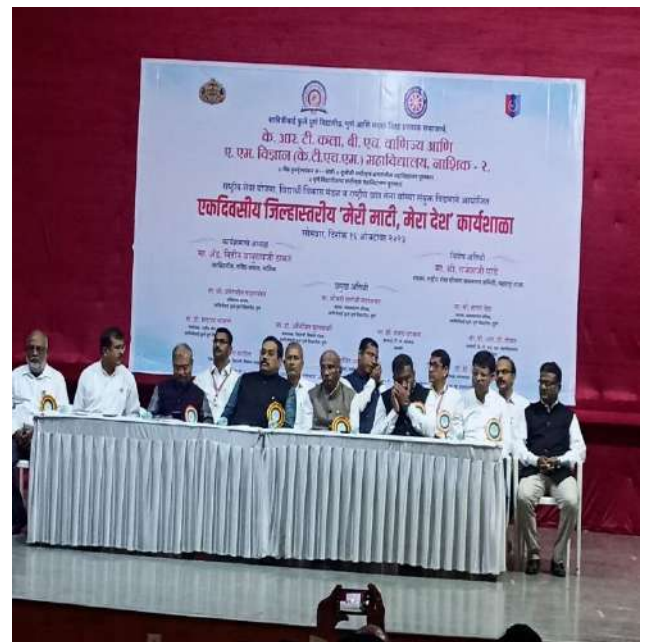
Students participated one day workshop on meri Mati mera Desh at KTHM