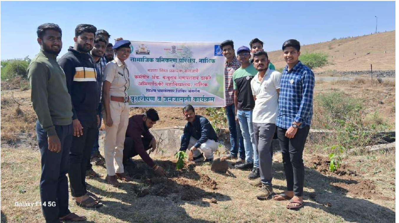
Tree plantation program participation of students on Environment Day