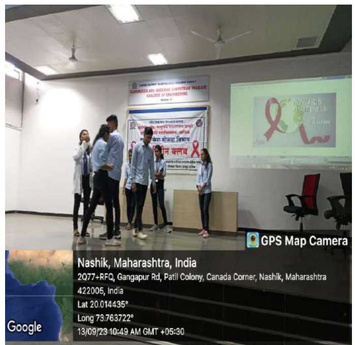
Students conducted activities to create awareness among students about 1)HIV/AIDS and Youth 2) Save Environment Poster