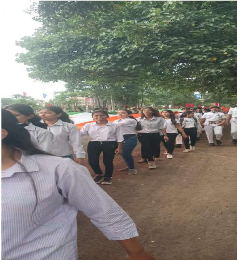
NSS students were participated in “1075 feet Tringa Yatra”