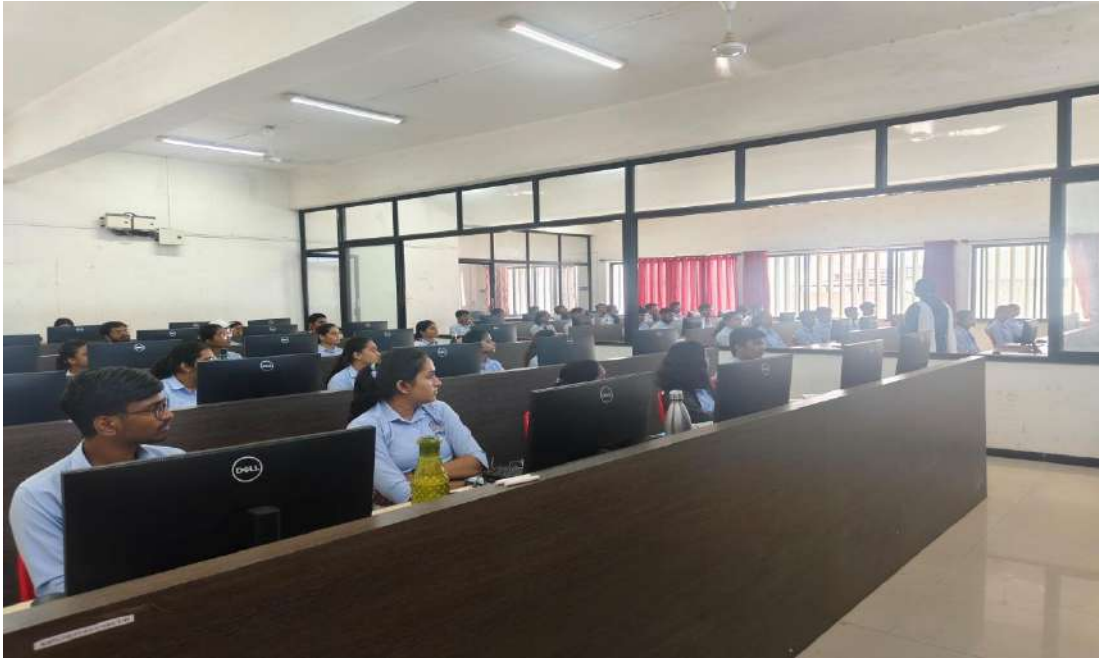
Workshop on C++