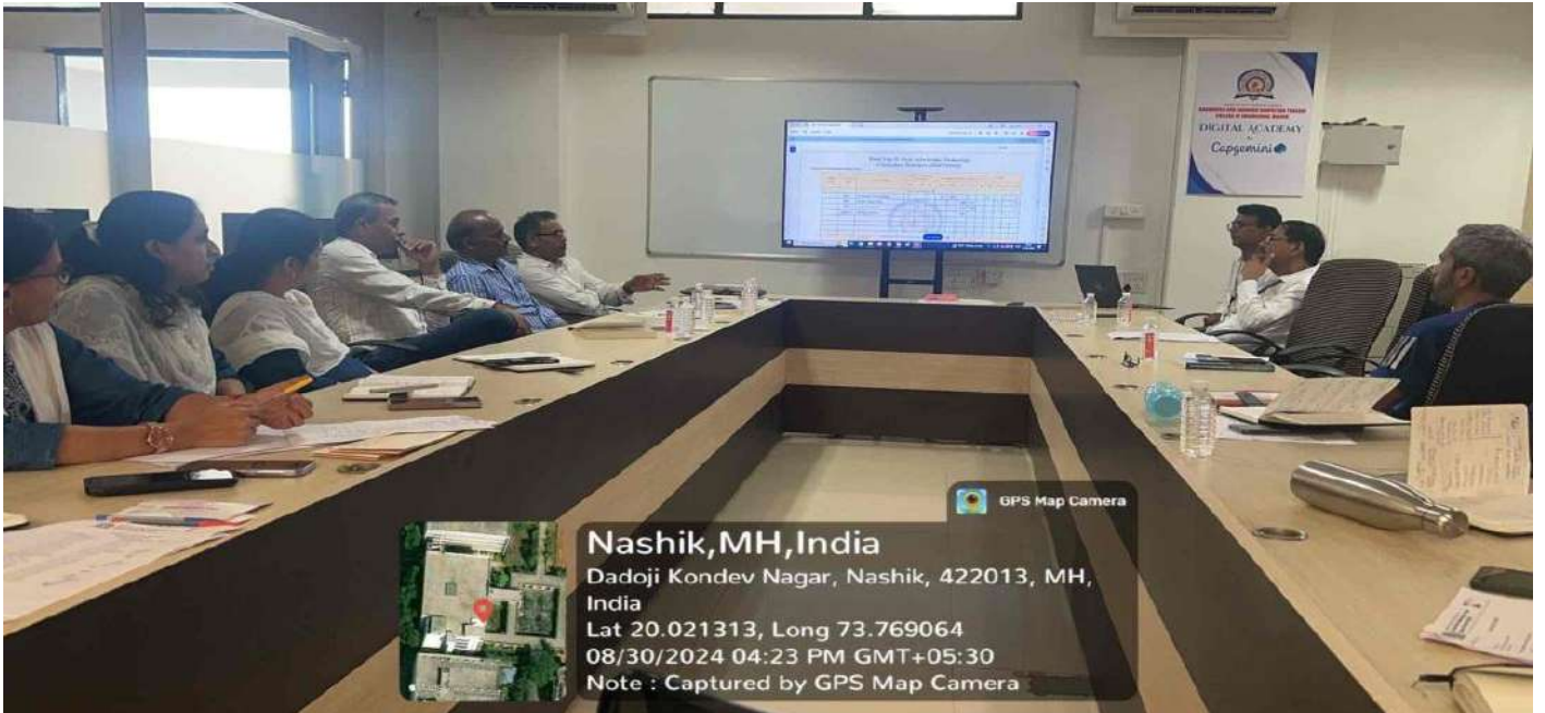
Board of Studies meeting