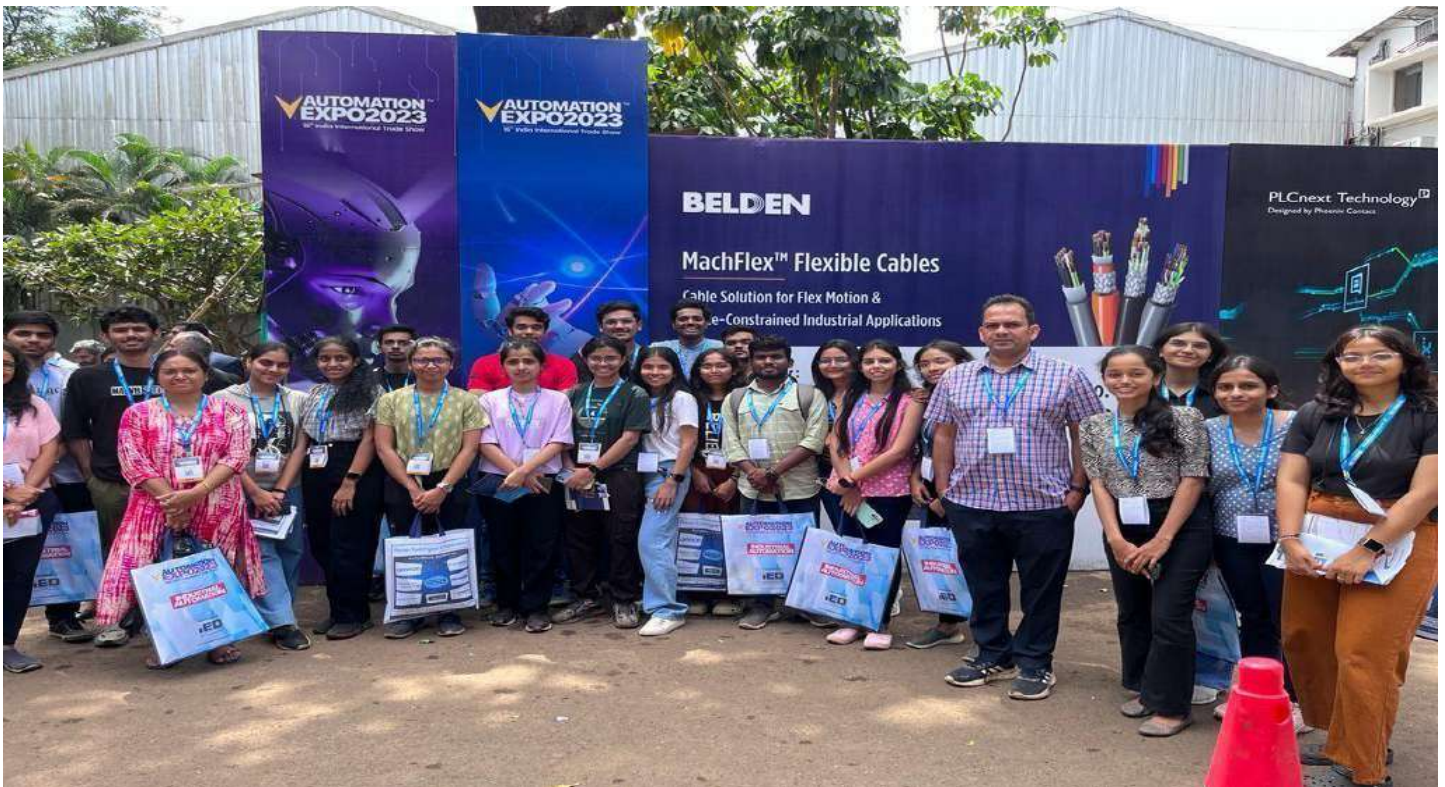
IT Department alumni, staff and student photo

Students of B.E I.T of our Information Technology department to visit Automation Expo 16TH India international trade exhibition on 24 th august 2023 . Visit to this exhibition have given the student an exposure to the international automation product standards and the technology trends in the field of automation. In Automation Expo 2023 students explore the latest in automation technology, robotics, and AI. Connect with industry experts and envision a future empowered by automation also, discover the possibilities and innovations shaping our world.