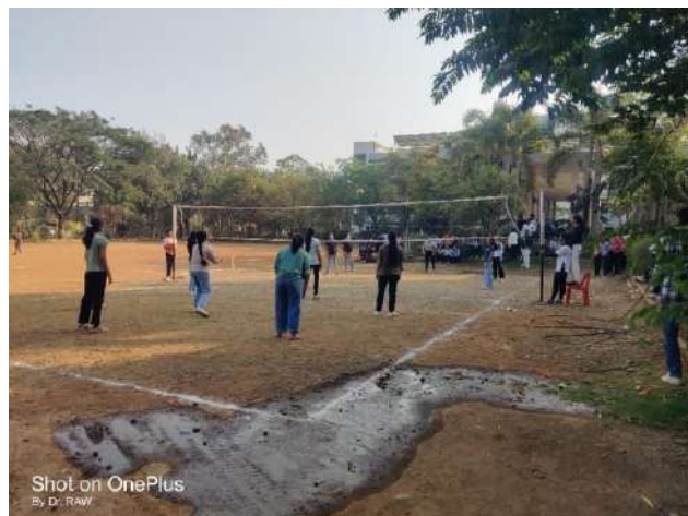
After the second session, the students of FY-BTech actively participated in a variety of sports activities on 24 th January 2025.