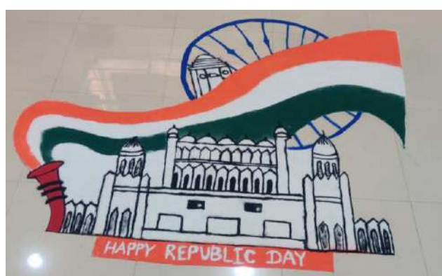
Art – Gallery Competition on 27 th January 2025