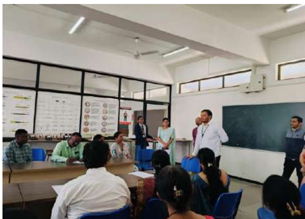
A Parent – Teacher Meet was conducted on 8 th February 2025.