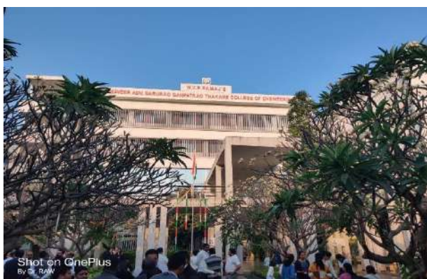
Celebration of Republic Day on 26 th January 2025