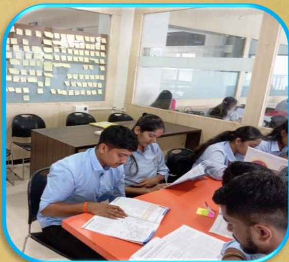
Coffy Katta Activity [25/09/2023]