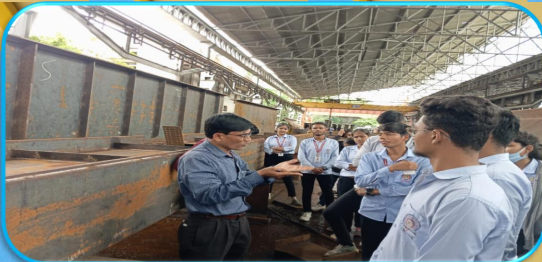
Centre Engineering Workshop Manmad, Centre Railway Dist. Nashik [22/09/2023]