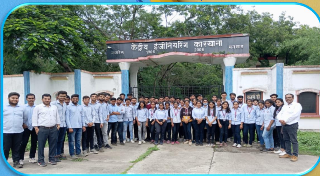
Centre Engineering Workshop Manmad, Centre Railway Dist. Nashik [22/09/2023]