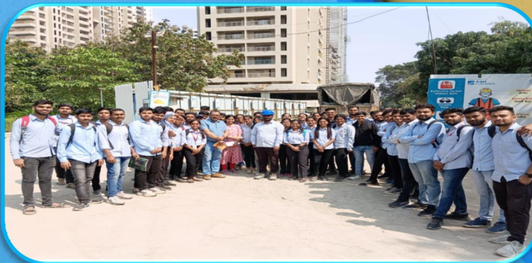
TREELAND ABH Gangapur Road Nashik [25/10/2023]