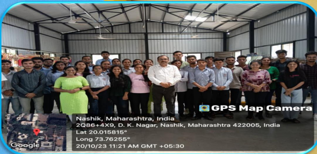
MVPS's KDSP Bamboo Workshop Dist. Nashik [20/10/2023]