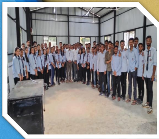
Bamboo Article Workshop Building, MVPS's K.D.S.P. Agriculture College Nashik [01/08/2022]