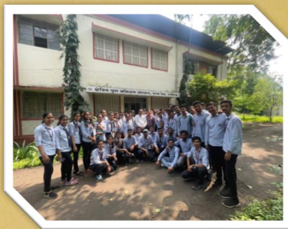
Centre Engineering Workshop Manmad, Centre Railway Dist. Nashik [27/09/2022]