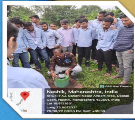
Visit to Meteorology station [29/09/2022]