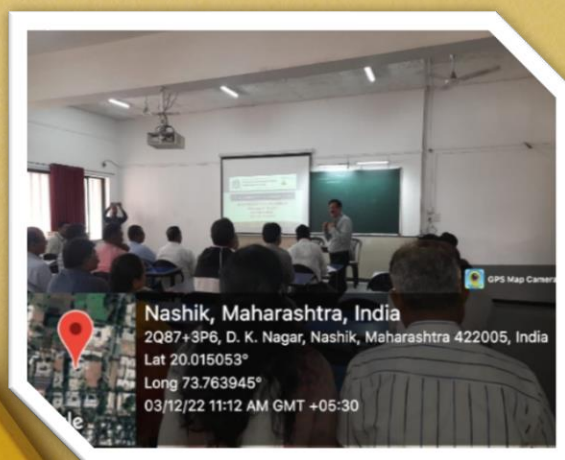
1.ABH Treeland, Gangapur Road Nashik 2. Parents - Teachers Meeting [3/12/2022]