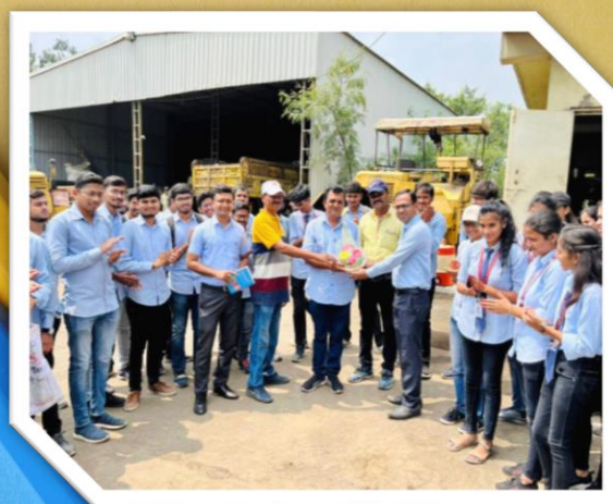
Visit to HOT mix plant Vilholi [28/09/2022]