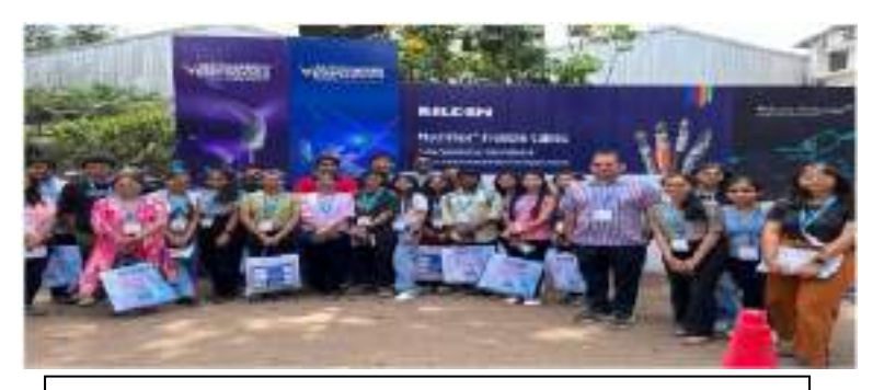
IT Department alumni, staff and student photo

field of automation. In Automation Expo 2023 students explore the latest in automation technology, robotics, and AI. Connect with industry experts and envision a future empowered by automation also, discover the possibilities and innovations shaping our world.