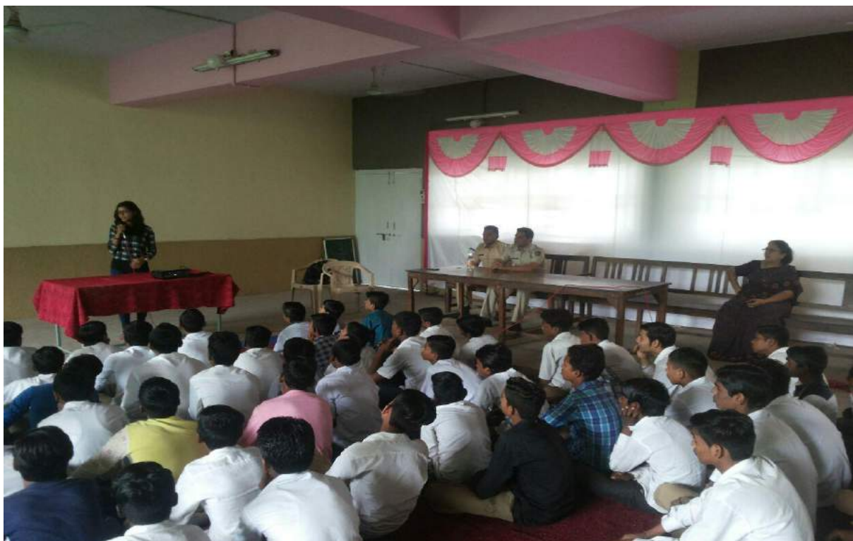
Glimpse of various program conducted under SAC cell in Nashik.