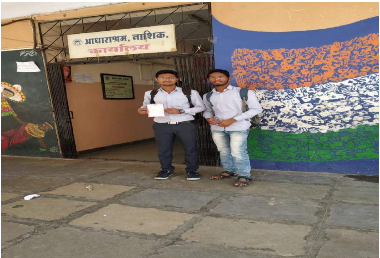
Donation of Pens for Childrens at Anath Ashram gharpure ghat,Nashik.( 20 September 2019)