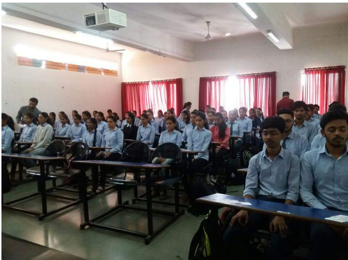
SAC Members had organised Expert Talk on “Meditation” by Art of Living Group. (30 January 2020)