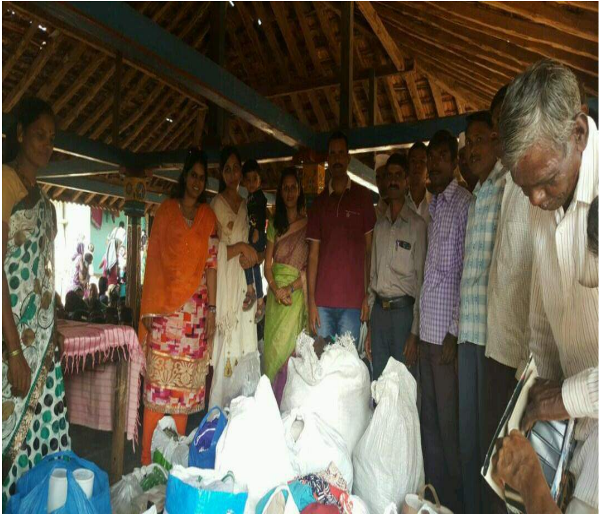
Donation of Food, Cloths & money to needy people by Saksham Sanghatan. (20 December 2019)