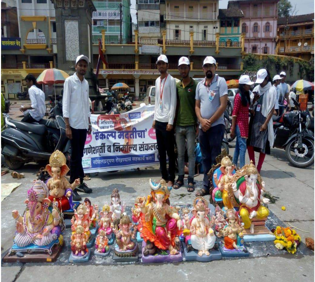
Ganesh Murti Sankalan at Godha Ghat Panchavati, Nashik. (12 September 2019)