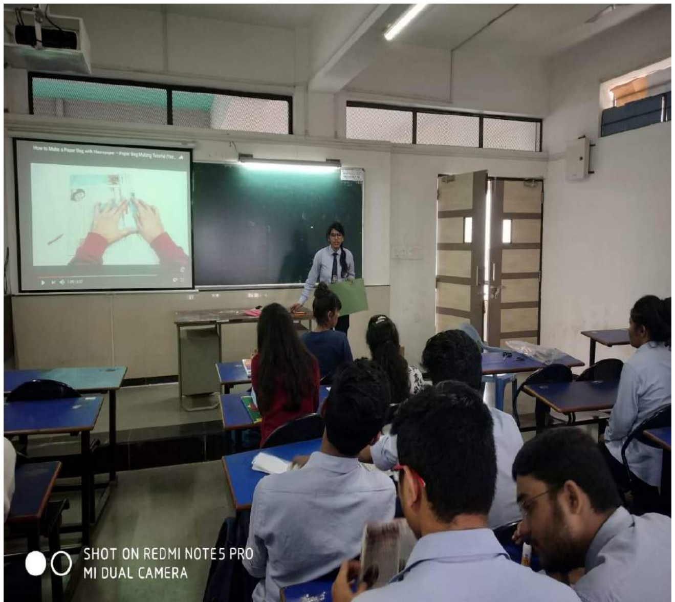
Bag Making Competition for third year students under the social awareness cell. (03 January 2019)