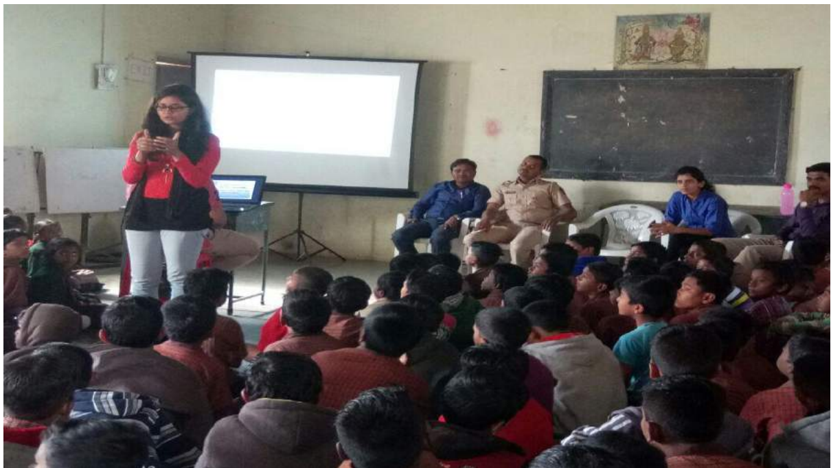
SAC Members gave expert talk of “Cyber Security at “Dyanvardhini Prasarak Mandal School” Nashik. (18 September 2017)