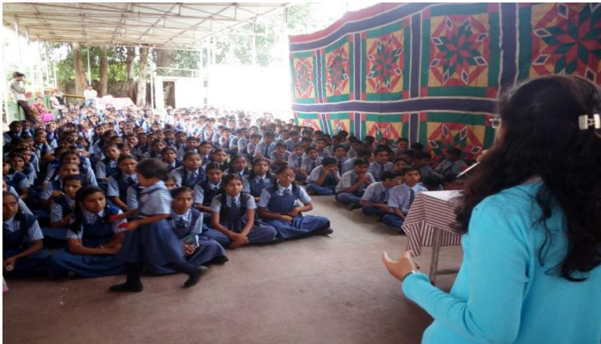
Glimpse of various program conducted under SAC cell in Nashik.