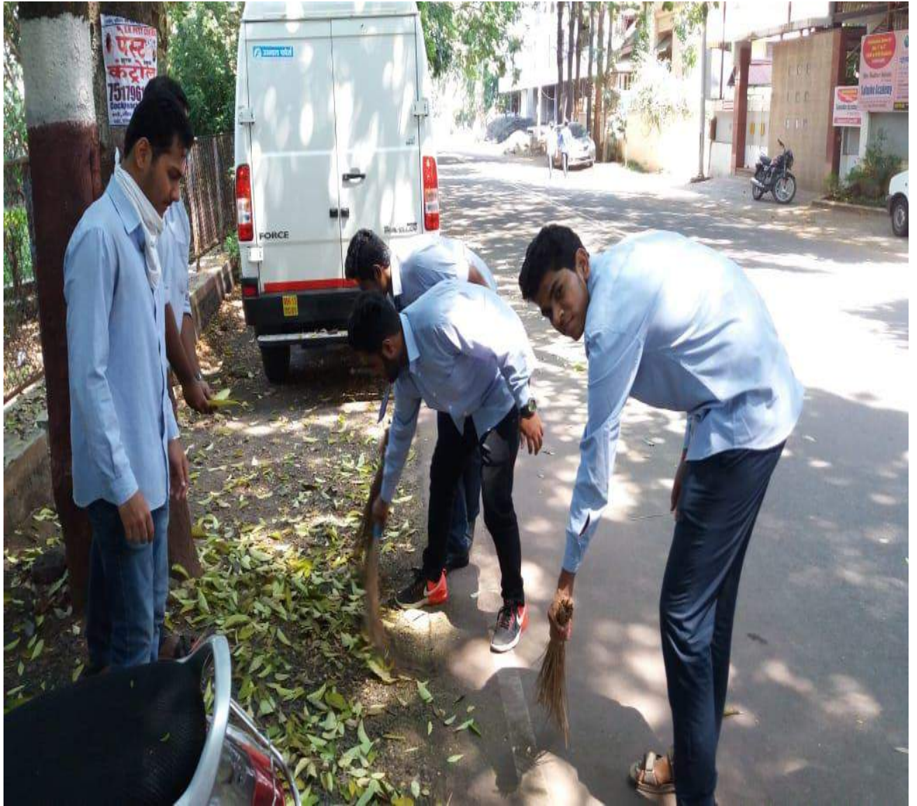
Cleaning Activity at Ram Mandir, Near KBTCOE Nashik. (05 March 2019)