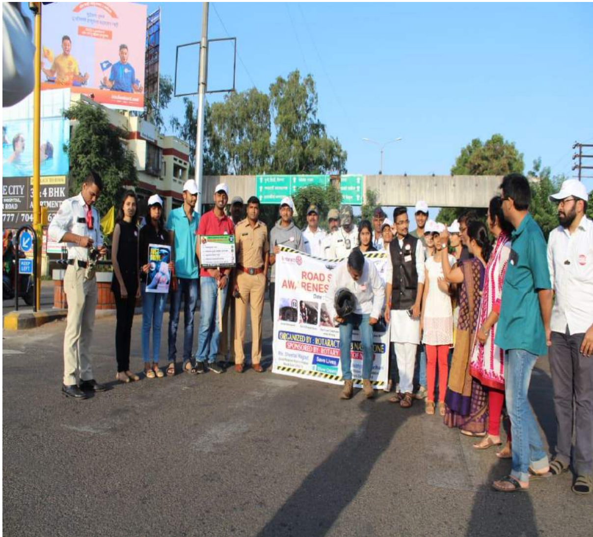
Road Safety Awareness Program at Various Areas in Nashik. (07 August 2019)