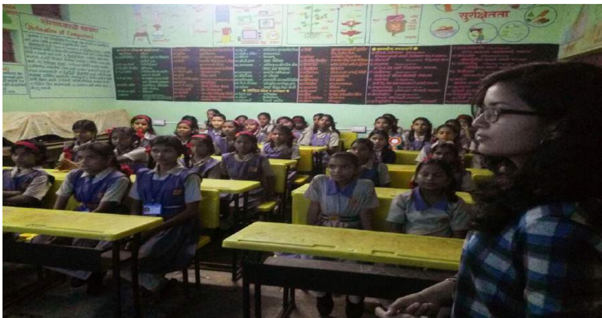
SAC Members gave expert talk of “Cyber Security at “MNC School Pathardigaon” Nashik. (24 March 2018)