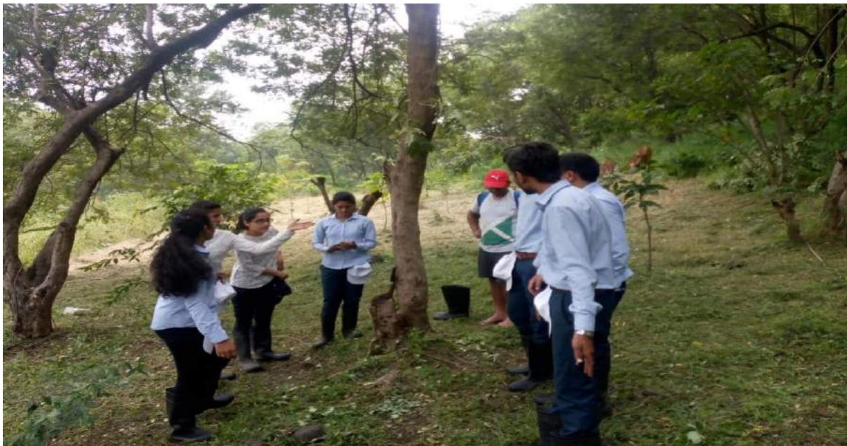
Tree Plantation Activity at various areas in Nashik. (26 July 2019)