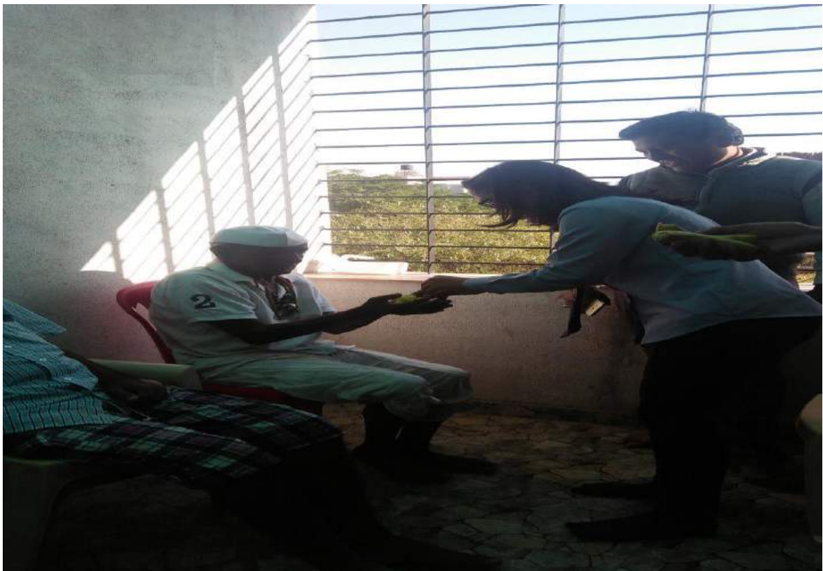
Donation of Fruits for old people at Manovedh Foundation, Nashik. (04 October 2019)