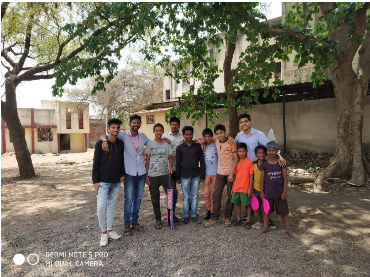
Donation of Sports Material among the all orphanages at “Adhartirth Adharshram” Anjneri Nashik. (04 January 2021)