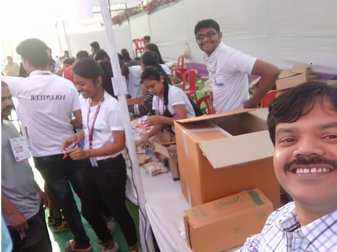
Volunteer for food & water supply