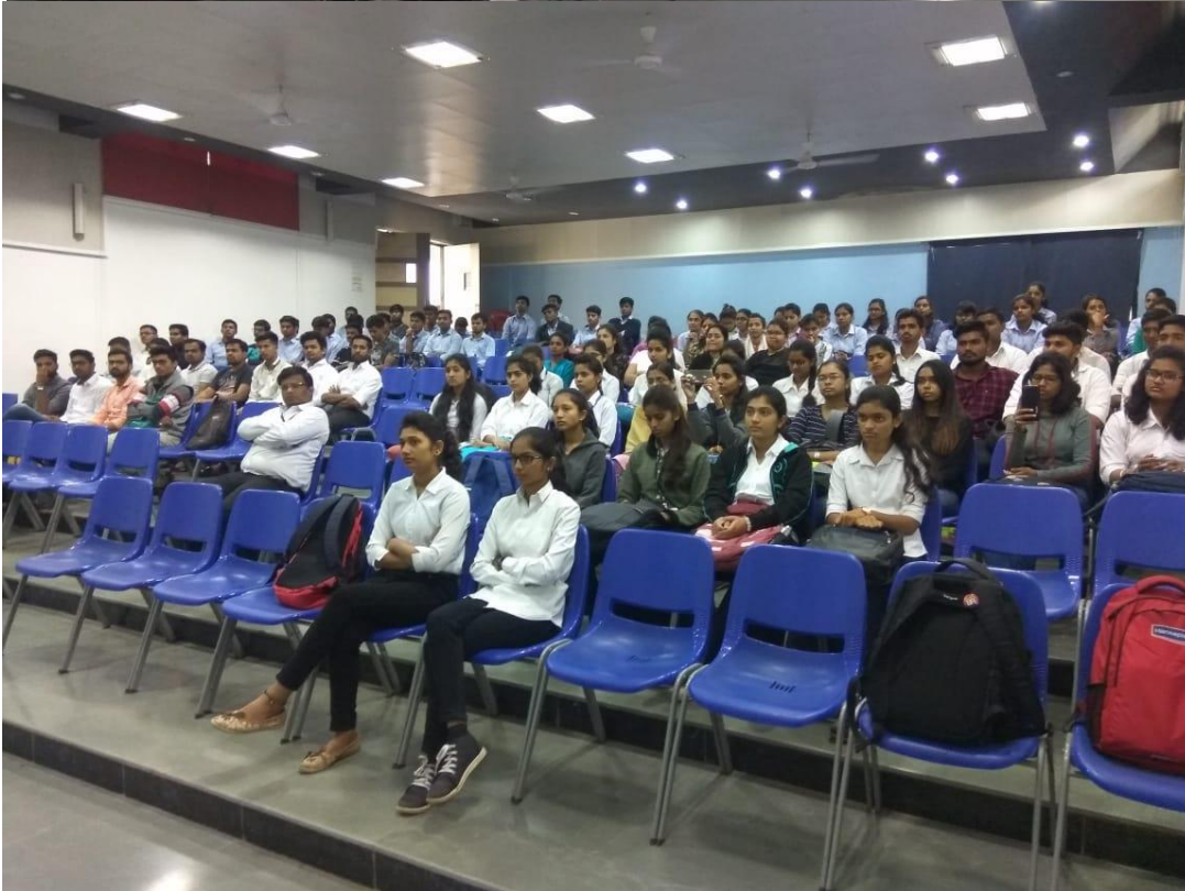
Audience for Savidhan divas