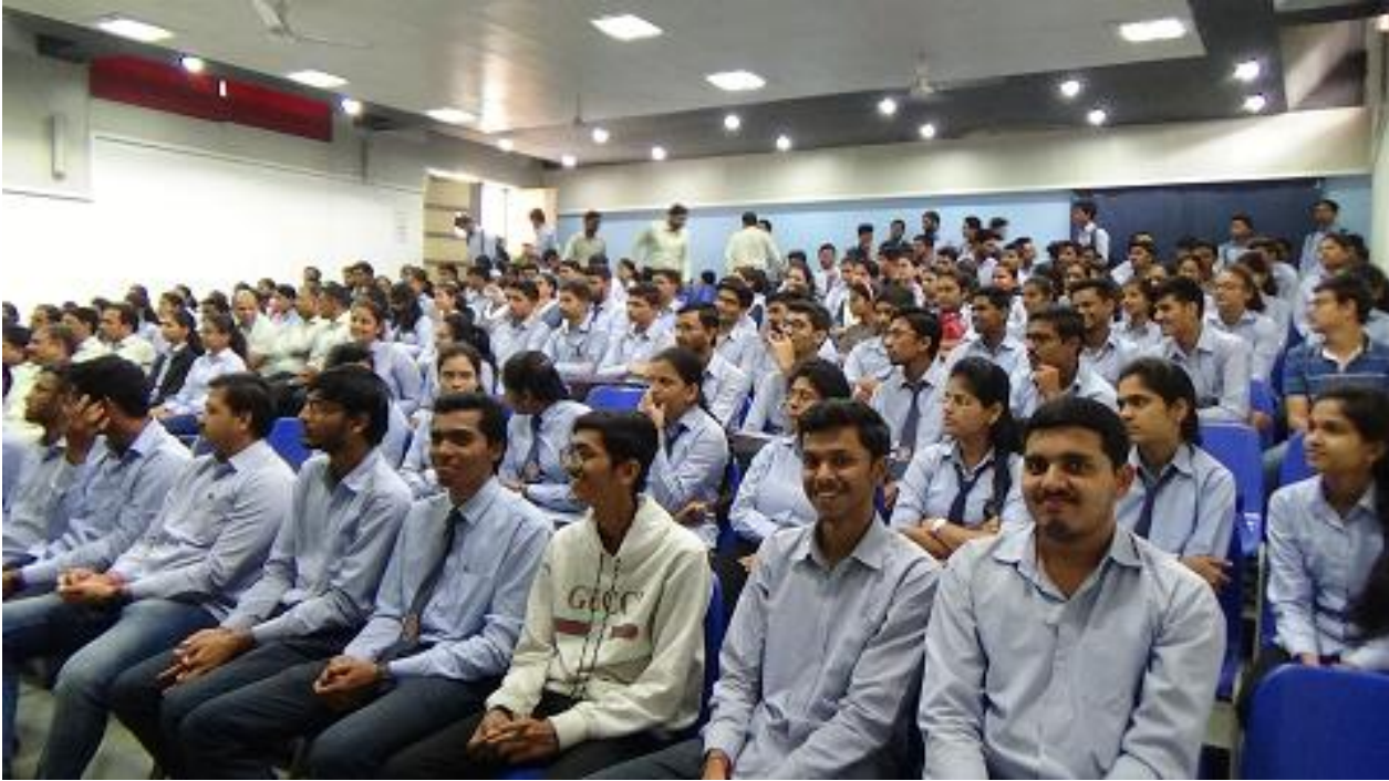
Audience for 'FIT INDIA MOVEMENT'