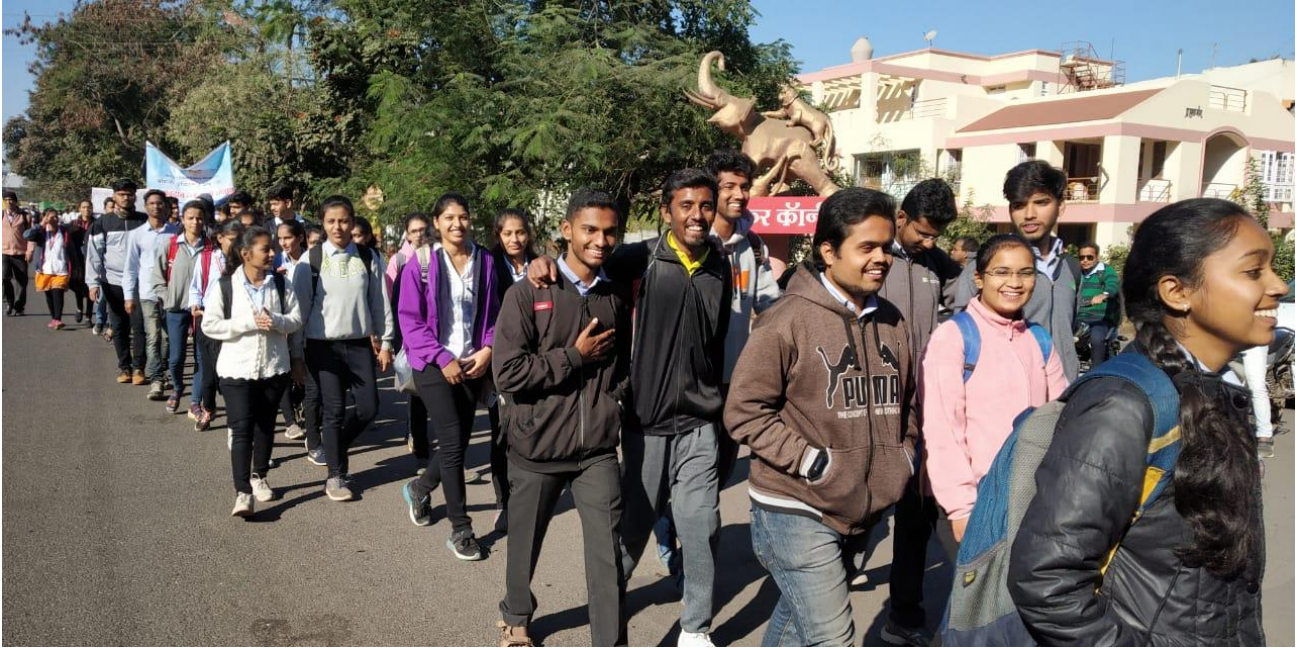
Students rally for Road Safety Awareness Campaign