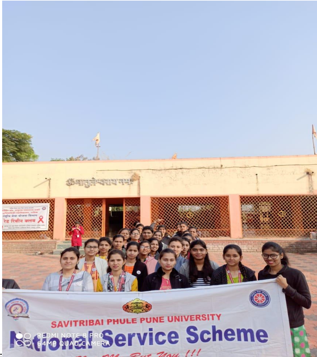
Rally at Matori for “BETI Bachhao BETI padao”