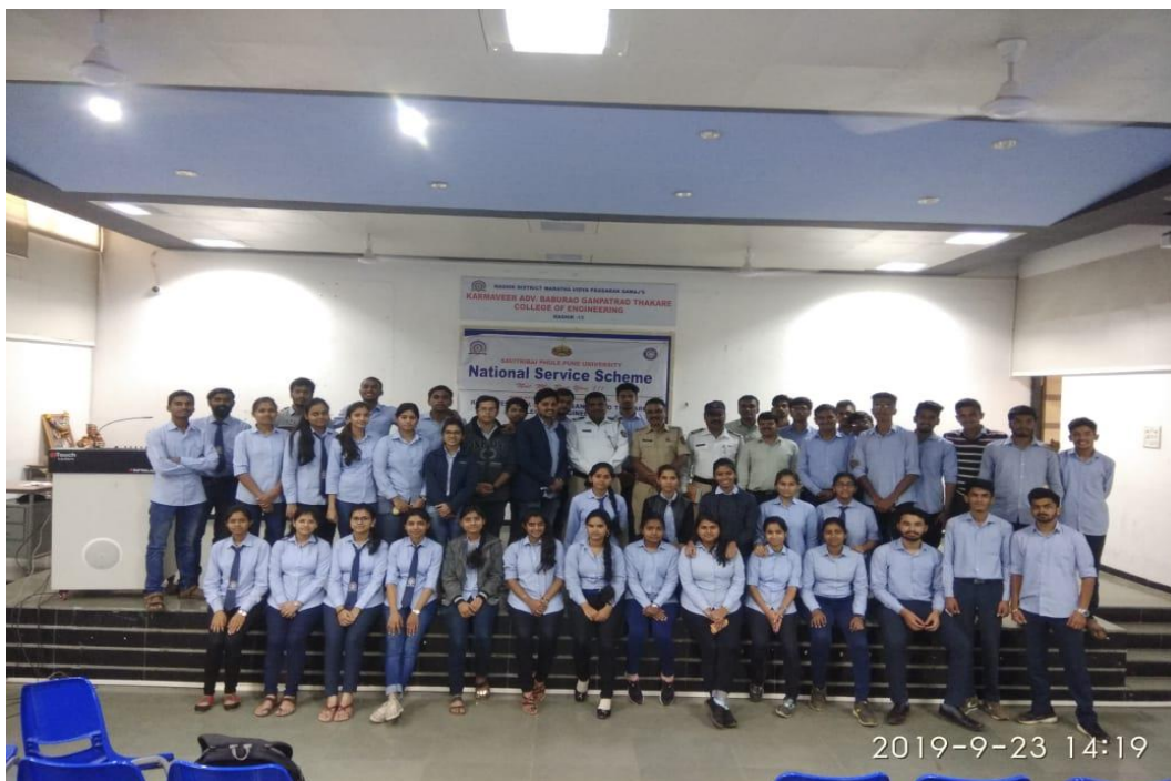
NSS Students, staff & Guest.