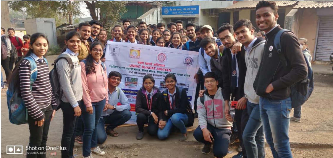
NSS students also Participation in Unnat Bharat Abhiyan