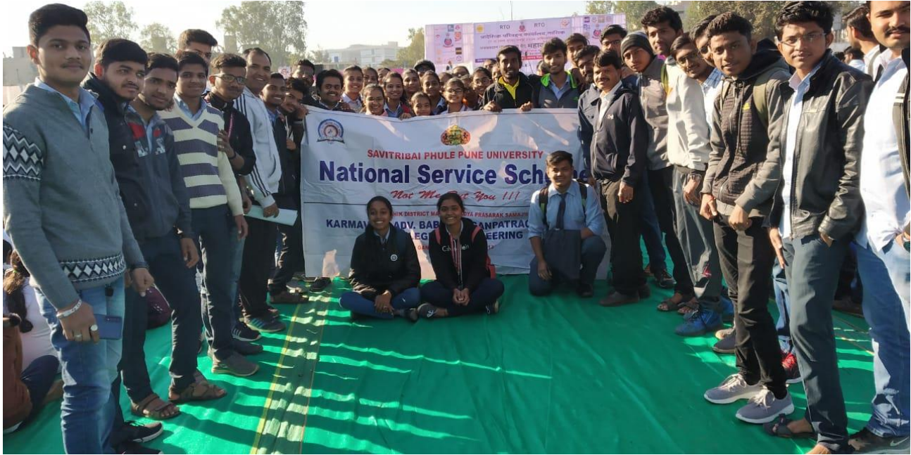
NSS students Participated in walkathon at Nashik organized by Department of RTO (17/1/2019) All NSS students participated in “ Mahawalkatan “