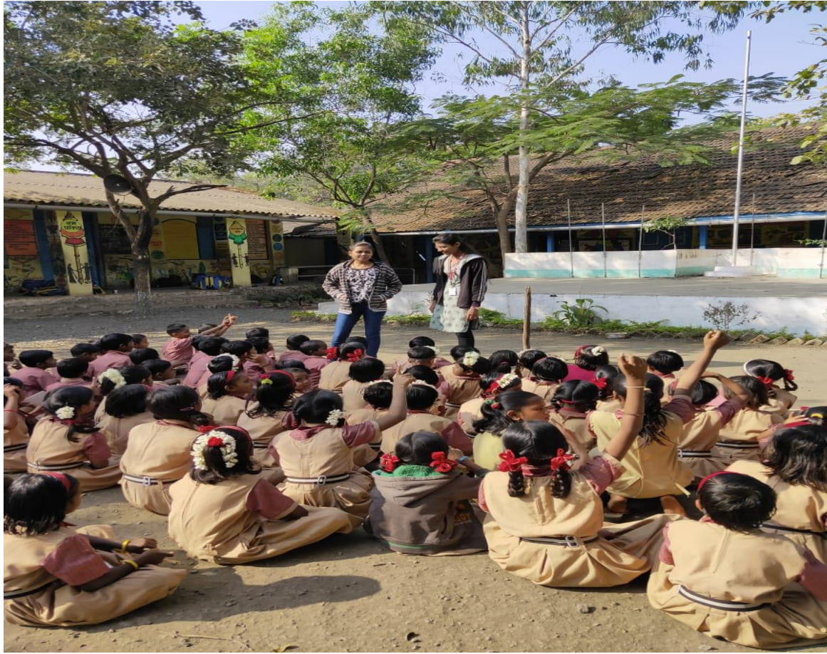
Awareness about girls education