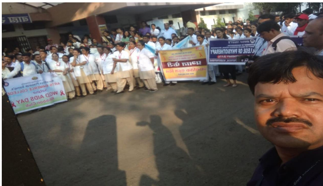
AIDS awareness campaign Rally under “Red Ribbon Club” (2/12/2019)