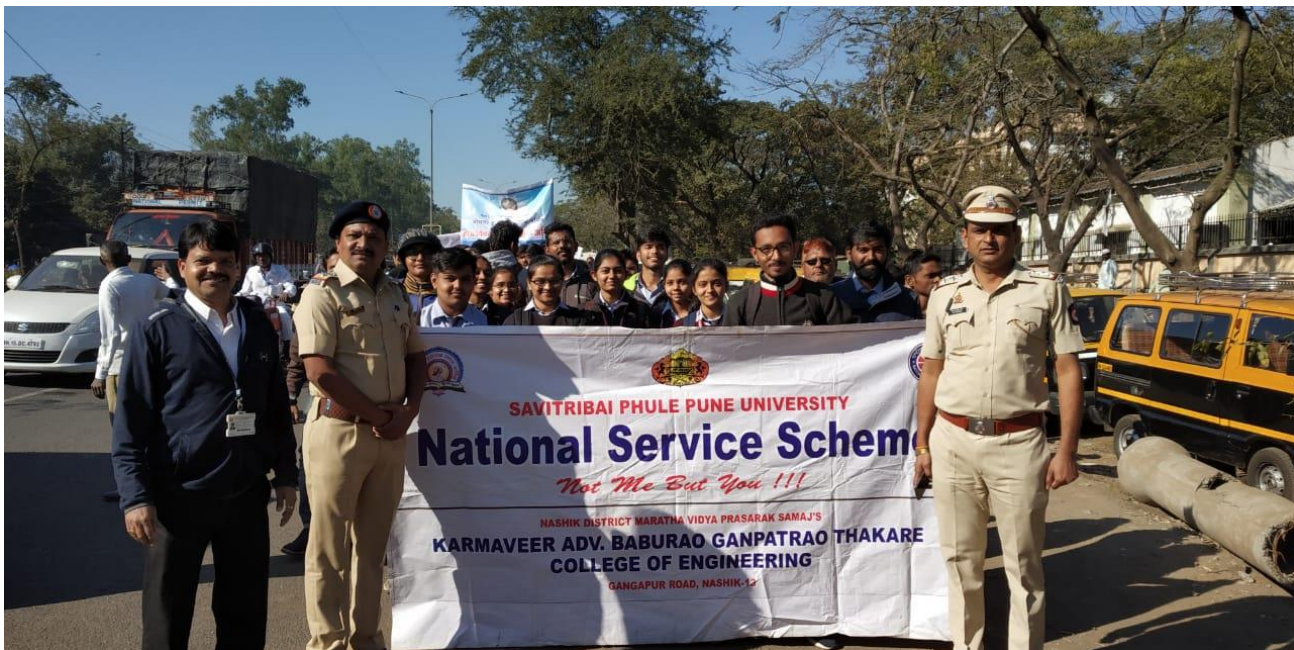
Students rally for Road Safety Awareness Campaign