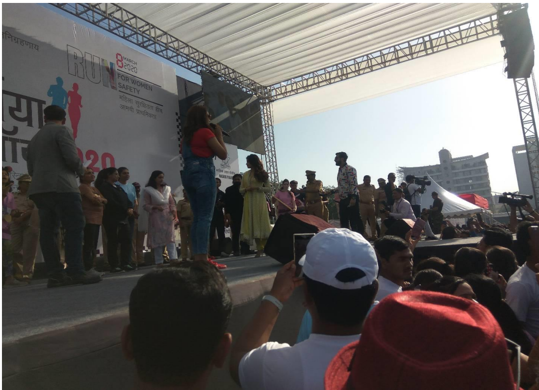
Volunteer work in prize distribution