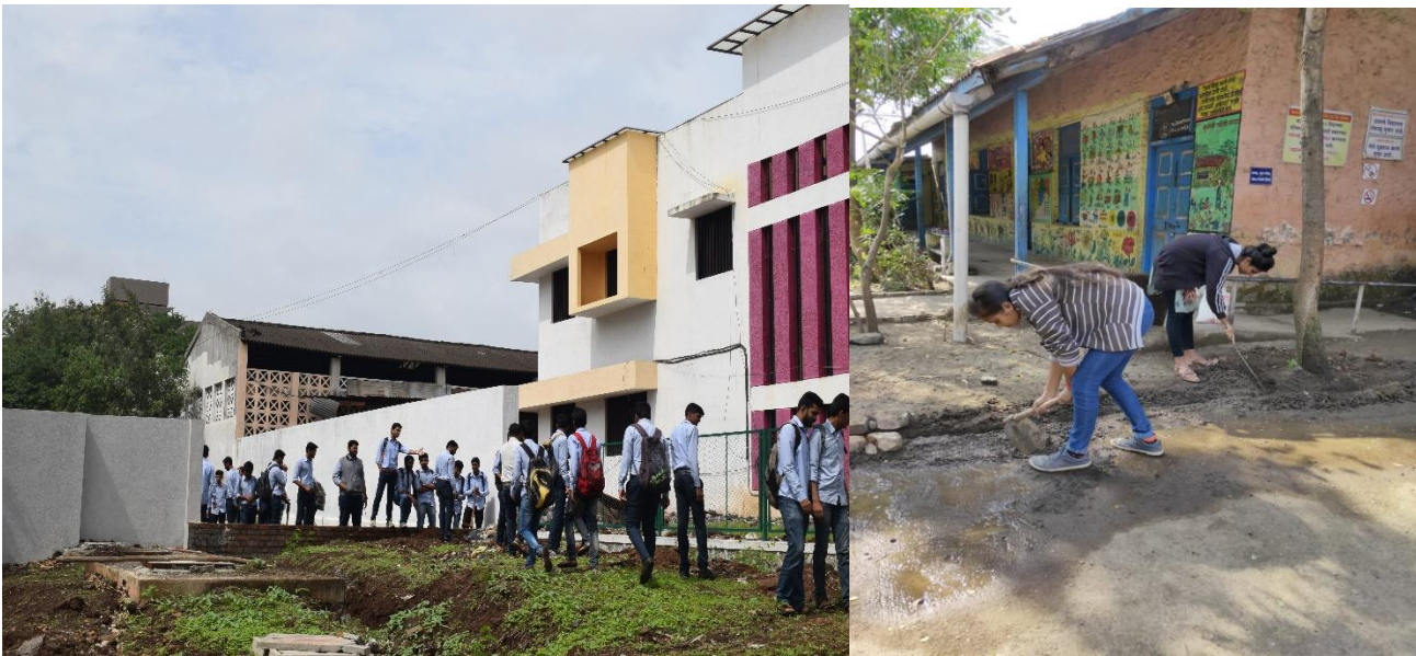
Campus Cleaning and School cleanliness in adopted village