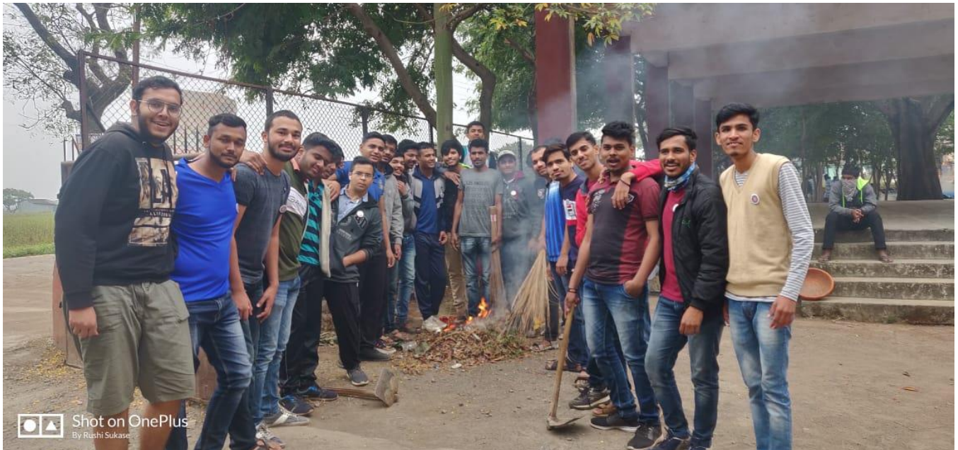
Cleanliness at Daraimata mandir stairs steps