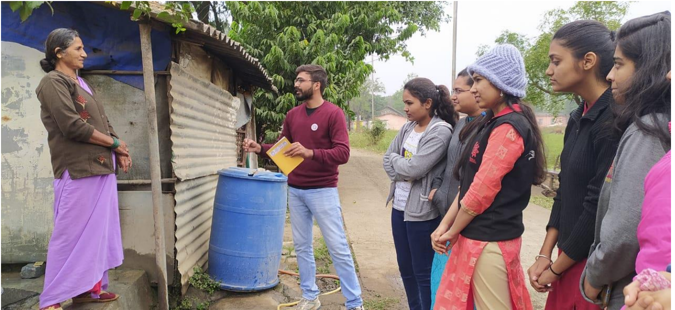
Awareness about Girls education & voting