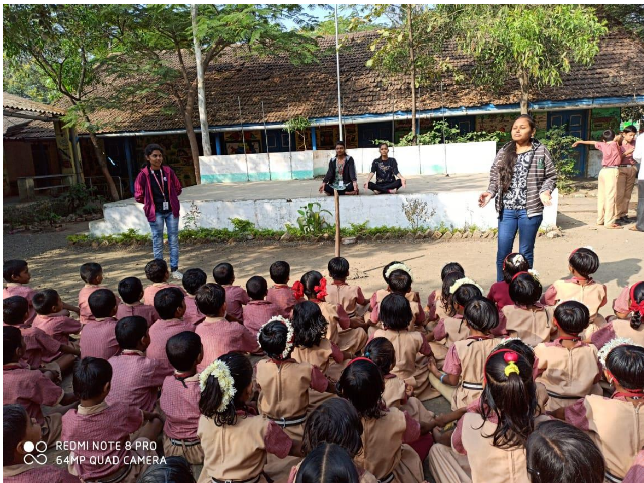
Campaigning about education in girls.