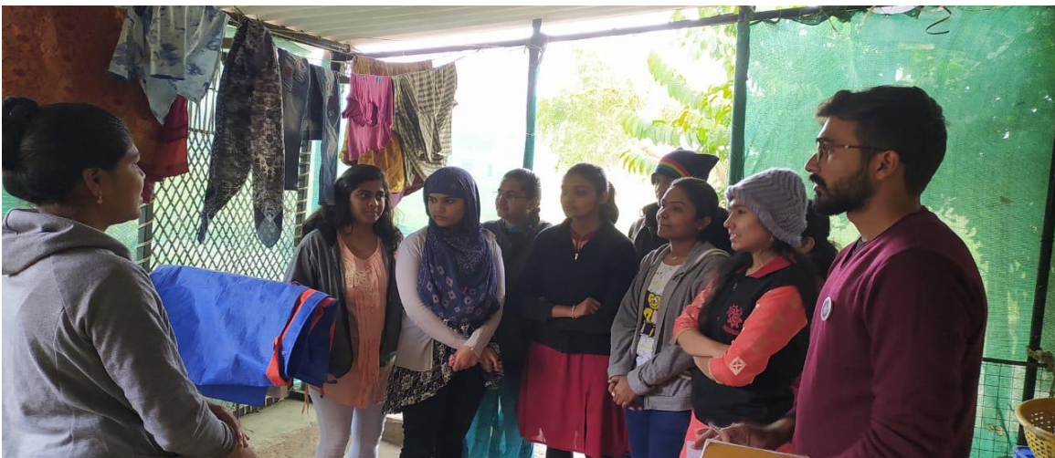
Awareness about girls education