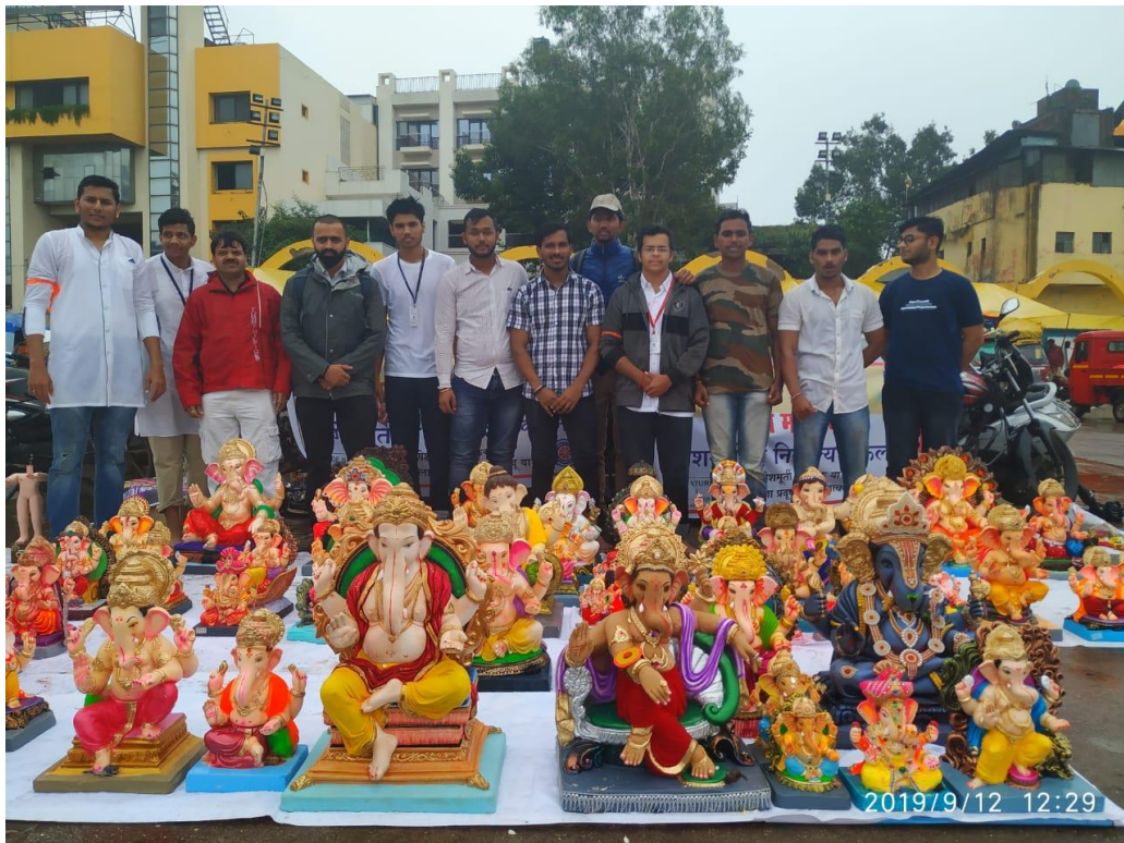
All Nss students was Ganesh Murti Collected to save Environment