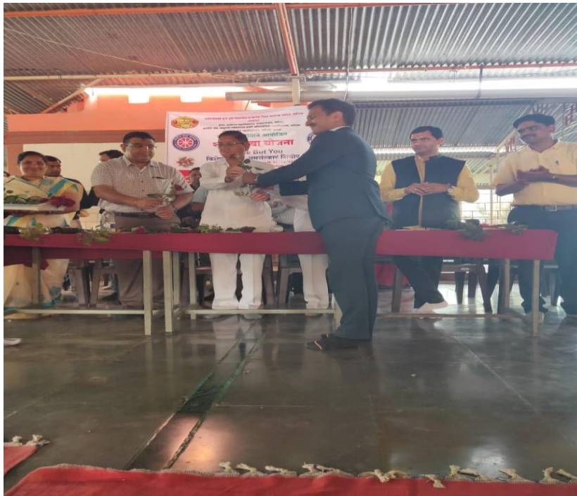
NSS students received awards.