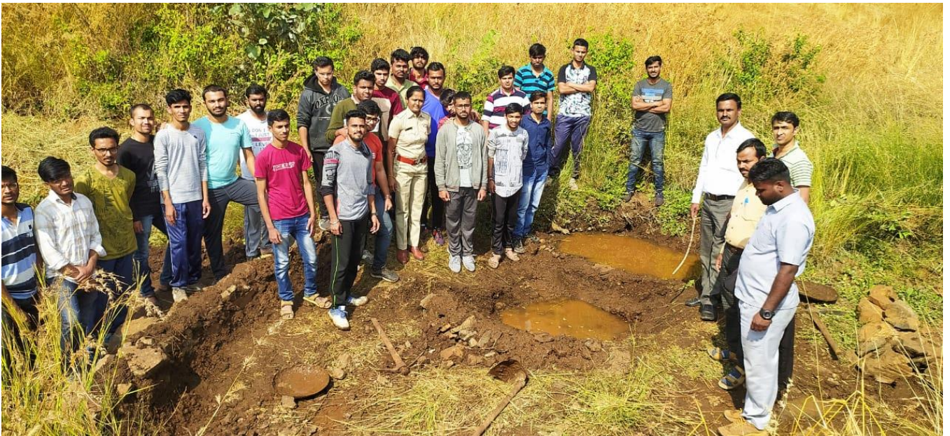
VA nrai Bhandhara