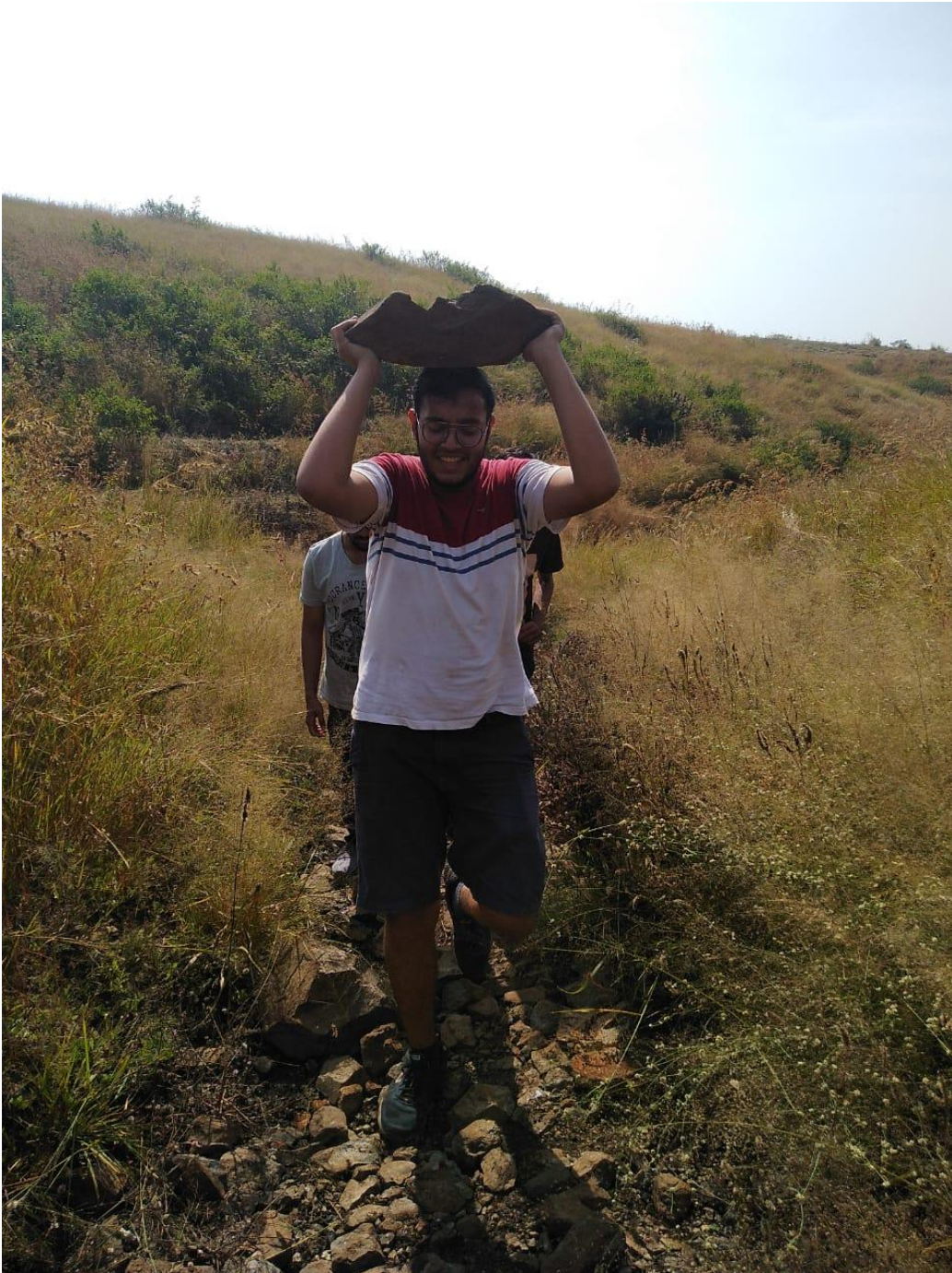
Cleaness at Darmatai Temple