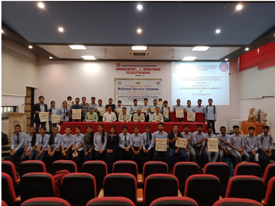
NSS Students, Staff & Guest Campaign for plastic free