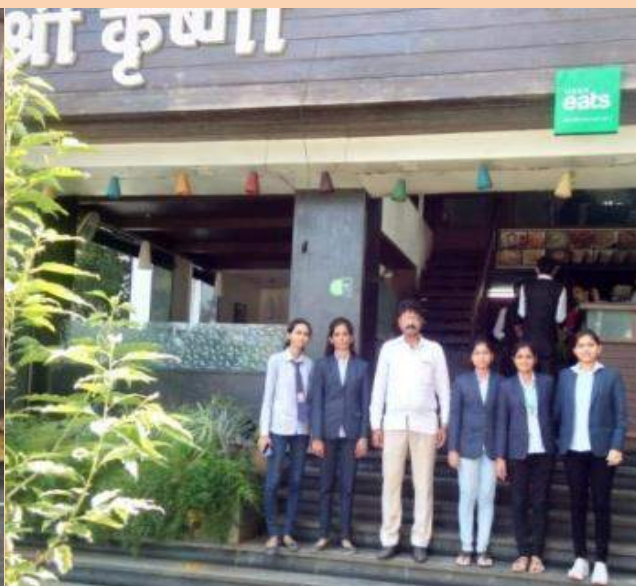
SY-MBA students interacting with various entrepreneurs