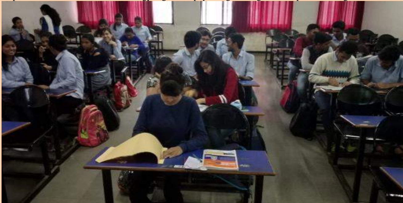
Students during the paper bag workshop

Department of Information Technology organized paper bag making workshop on 20 th August 2018.