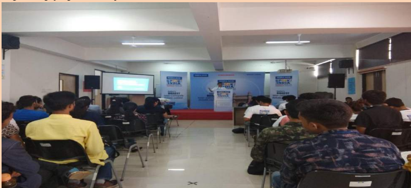
Participants expressing their views during the Speak India debate competition