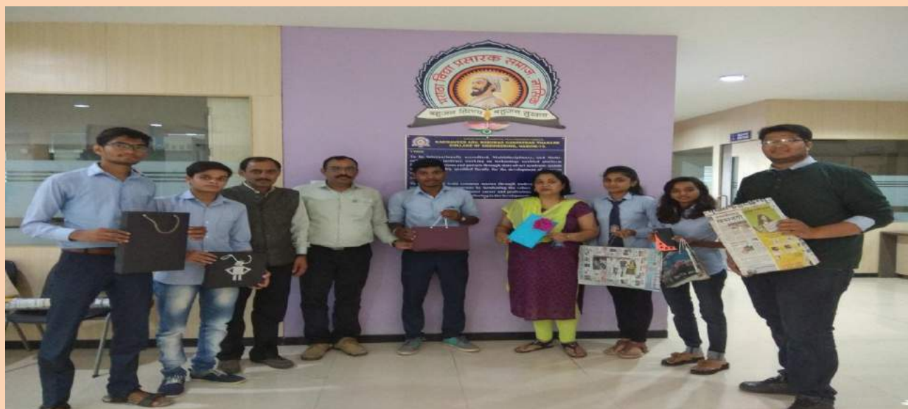
Experts and students after the making of paper bags during the workshop