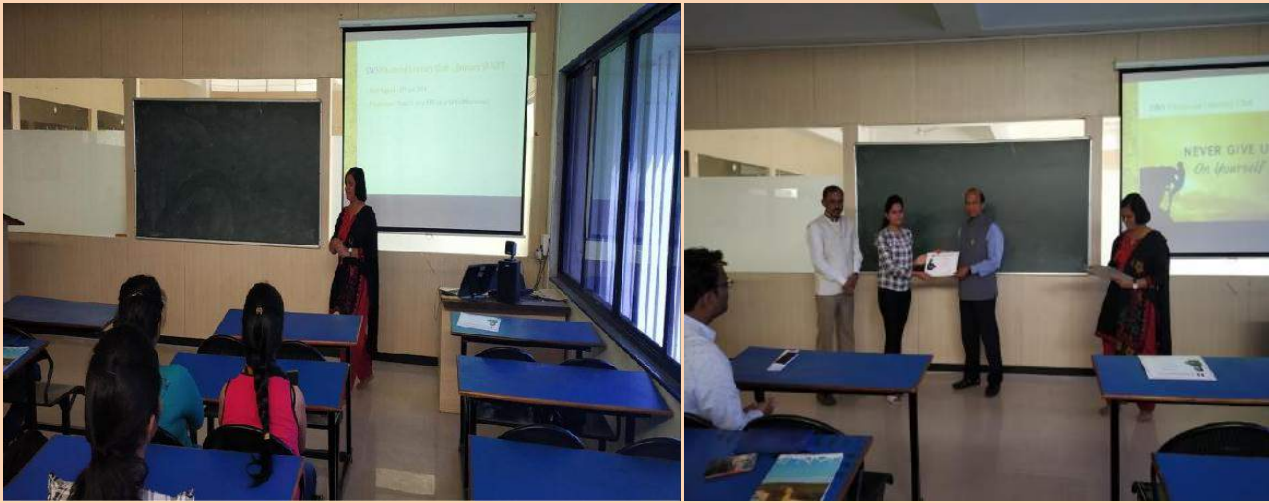
Certificate distribution to MBA Students during the concluding session