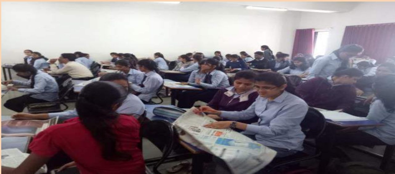
Students during the paper bag making workshop