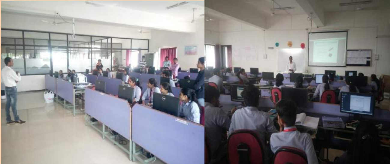
Expert interacting with students during the seminar

Department of Computer Engineering organized a seminar on “Entrepreneurship and Digital Marketing” on 24th September 2018.