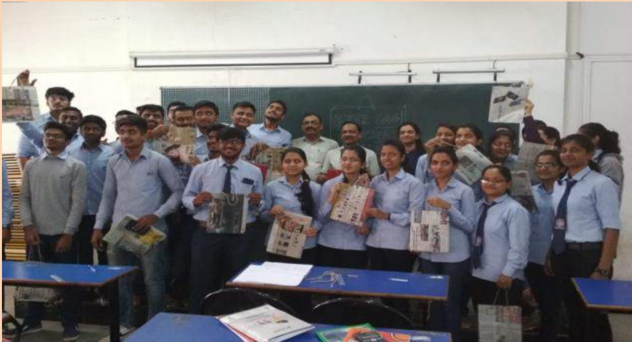
Students & staff during the paper bag making workshop

The department of Civil engineering organized a workshop on Paper Bag making on 30 th August 2018.