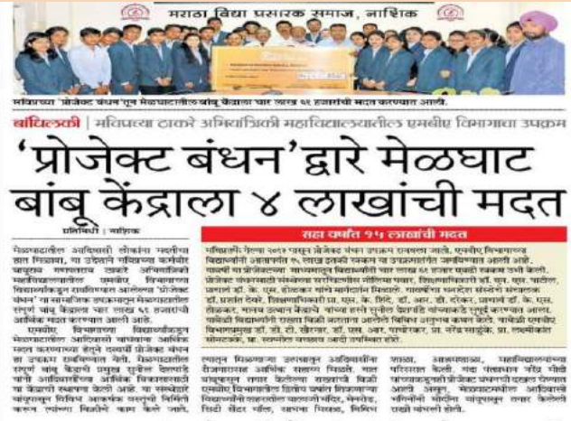
MBA staff and students during the cheque handing –over ceremony of Project Bandhan