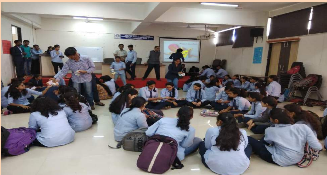
Students preparing the rakhi with the help of DIY kit during the workshop

The ED Cell of the institute organized a one day Raakhi Making workshop for the students of engineering. Department of MBA has been conducting Project Bandhan since 2013. The students of second year MBA who worked for Project Bandhan this year guided the participants of the workshop in crafting beautiful Raakhi with the help of DIY Raakhi Kit.