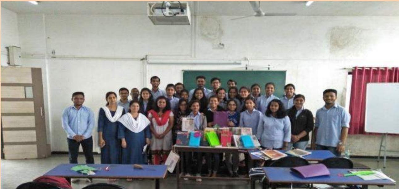
Students & staff during the paper bag workshop

Department of Computer Engineering organized a workshop on Paper Bag making. Government of Maharashtra has banned the use of plastic bags; hence for the promotion of eco-friendly Paper bags use, the department organized a Paper Bag Making workshop on 28 th August 2018. Students actively participated in the workshop and prepared the bags from the waste paper.