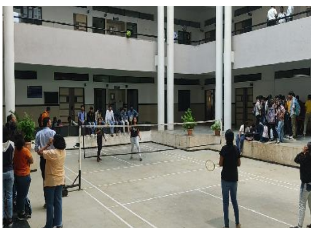
“Sport Sessions” on 9 th November 2022