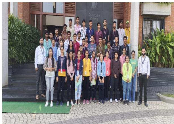
An Industrial Visit to Sahyadri Farms on 15 th November 2022.