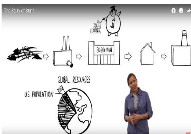
A session on “Universal Human Values” through short films on 5 th November 2022.