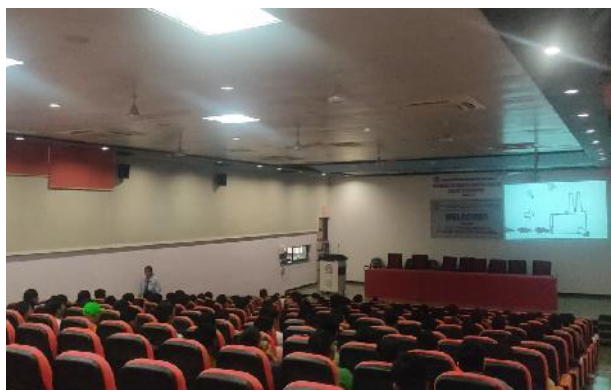
An educational short film: “Right Here Right Now” on 10 th November 2022.