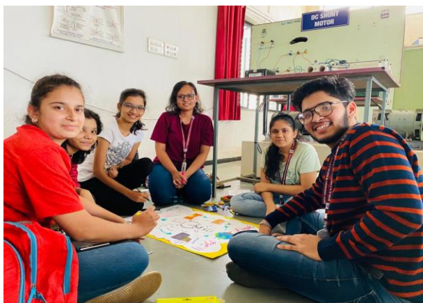
A team building activity: “Poster Making” on 12 th November 2022.