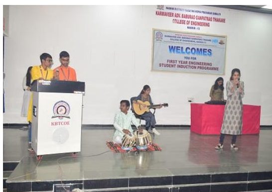
Cultural Activities on 18 th November 2022.