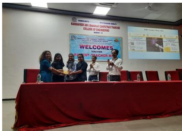
Quiz – Competition Event Winners