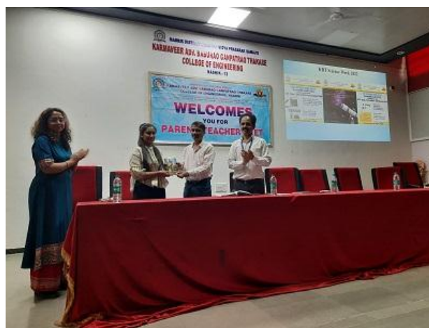
Poster Competition Event Winner