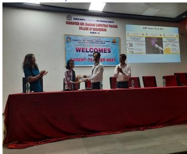
KBT Circle Design Event Winner