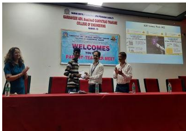
Video Making Competition Event Winner