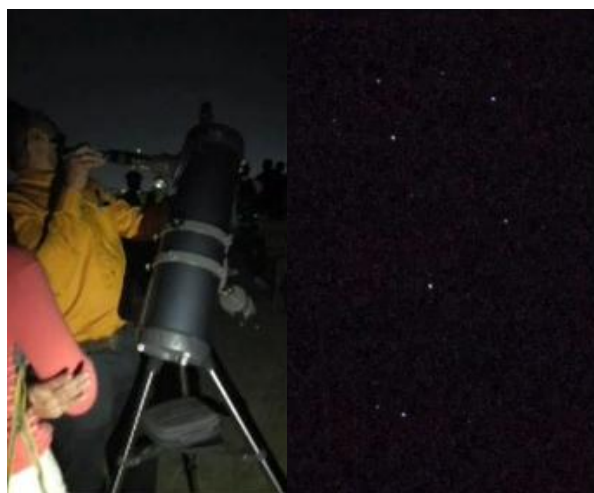
Sky Watching Session (03/03/2022)

On occasion of Science day, KBT Science Week 2022 was celebrated during 28 th February to 5 th March 2022 which also included Sky – Watching session on 3 rd March 2022.