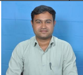
Asst. Network Administrator