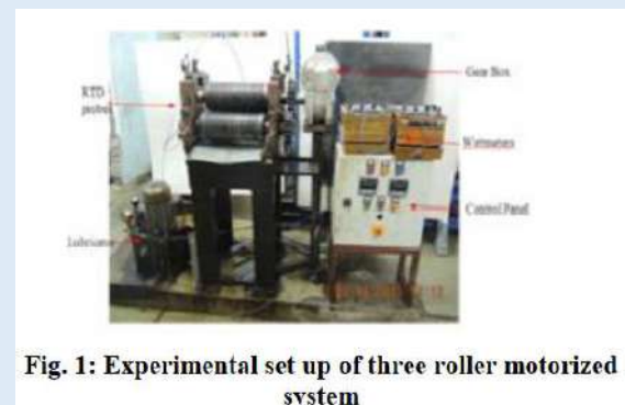
Fig. 1: Experimental set up of three roller motorized system

□ The lubrication system maintains the required oil pressure within the journal bearings, helping to prevent overheating and reduce wear caused by friction under high load conditions.