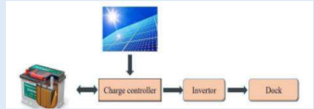
Fig: Block Diagram