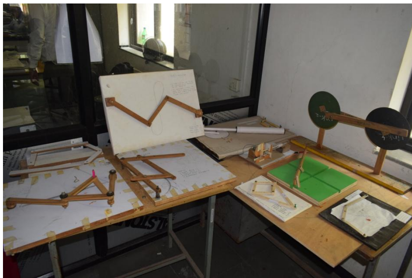
Fig. 1 Photograph of mechanism models

Mechanism models have been developed and animated videos are availed in the theory of machines laboratory for better understanding of theory of machines subject. Students of Mechanical Engineering are gaining the fundamental knowledge of kinematic pair, link, element and degree of freedom by handling the models of different mechanisms. Animated videos are providing better insight and visualization of motion transmission in the mechanisms during practical sessions of students.