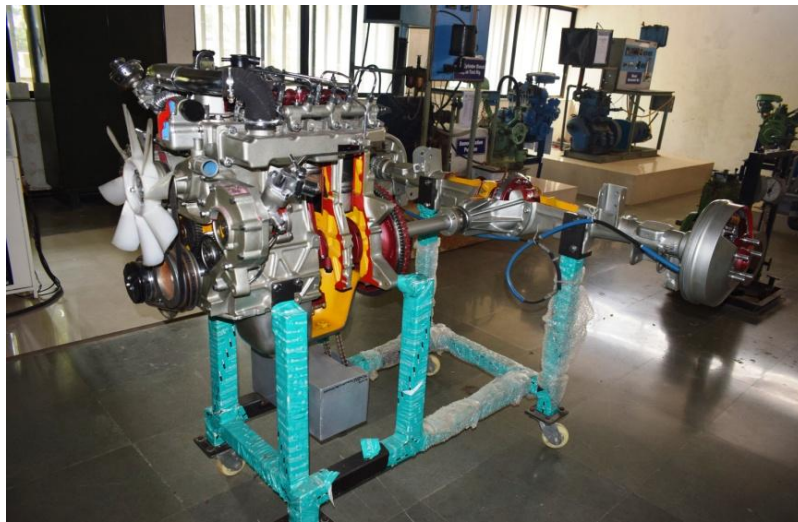
Fig. 2 Photograph of motorised cut section of internal combustion engine

Motorised cut section model of Internal Combustion Engine has been developed for learning the functioning of different components of automobiles. Electrical motor is used as the prime mover for supply of power to the crank shaft of engine. Students can easily understand the power transmission from crank shaft to the wheel. This working model consists of engine, propeller shaft, differential gear box, electrical motor, clutches and wheel.