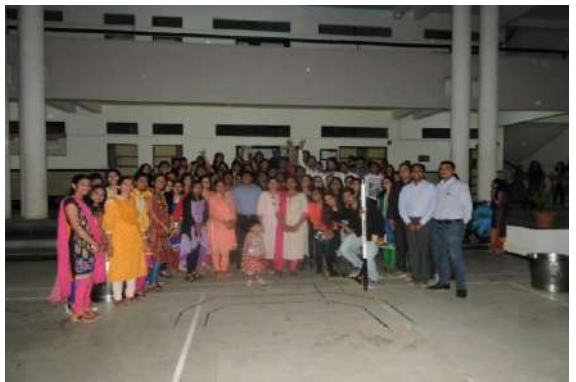
Staff of IT Department during the function

The Department of IT, Instrumentation & Control Engineering, Civil Engineering, Computer Engineering, Mechanical Engineering, MBA & MCA also organized Farewell for their students. Few glimpses of the programs are: