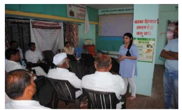
Students and staff interacting with the villagers in Gram Panchayat Office, Karanjgaon