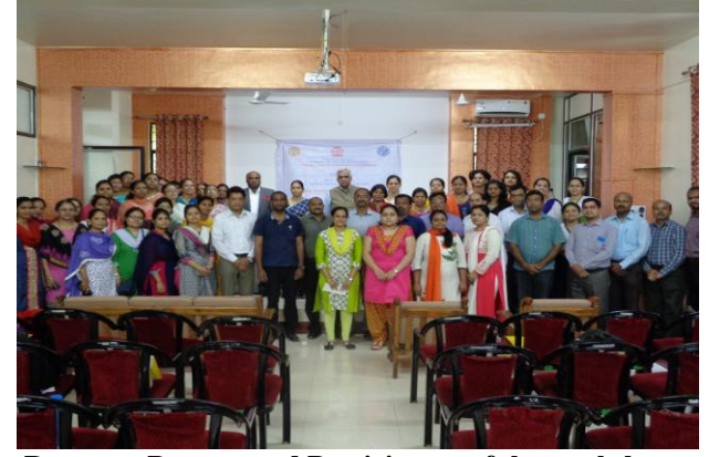
Resource Persons and Participants of the workshop

■ FDP on "Developing Multidimensional Competencies in Teachers" (4<sup>th</sup> to 9<sup>th</sup> June 2018)