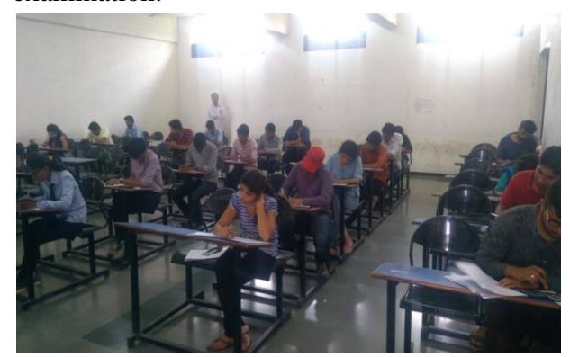
Students during the examination

Fox Solutions conducted the examination of 4<sup>th</sup> batch of MVP-FOX Automation Training Center on 8<sup>th</sup> June 2018. A total of sixteen students appeared for the examination. Mr. More (Fox Solutions) supervised the examination.