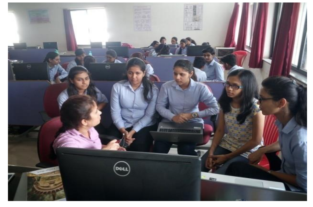
Project discussion during the training sessions

(Servlets). Applications of the concepts in project were also demonstrated during the training.