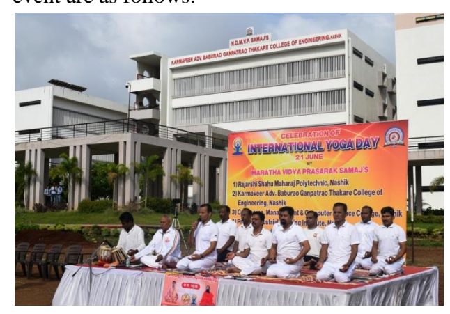
Team of Yoga trainers guiding the audience

leading a healthy life. Few glimpses of the event are as follows: