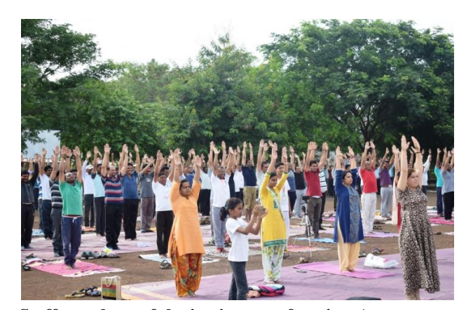
Staff members of the institute performing Aasanas