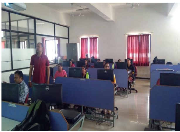
Hands on session during training