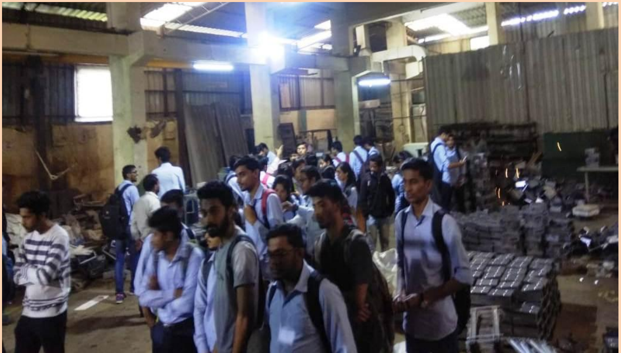
Industrial Visit of the participants of the workshop at Shree Ganesh Industrial Control, Nashik