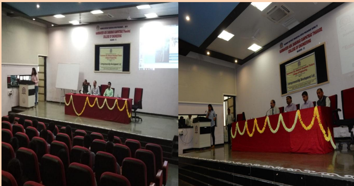
Student representative, Ms. Pooja Saner ensured the smooth flow of the activities through anchoring