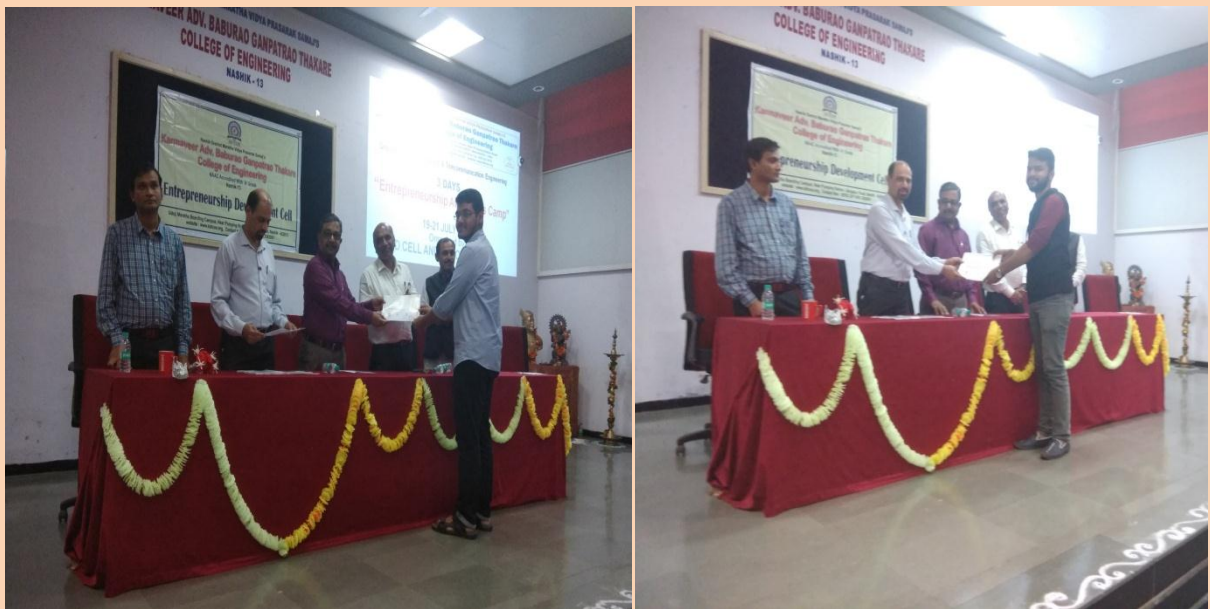
Workshop Participants receiving the Participation Certificates