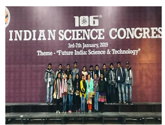
Students participated in 106<sup>th</sup> Conference organized by Indian science congress Association at Lovely Professional University, Pharwara, Jalandhar