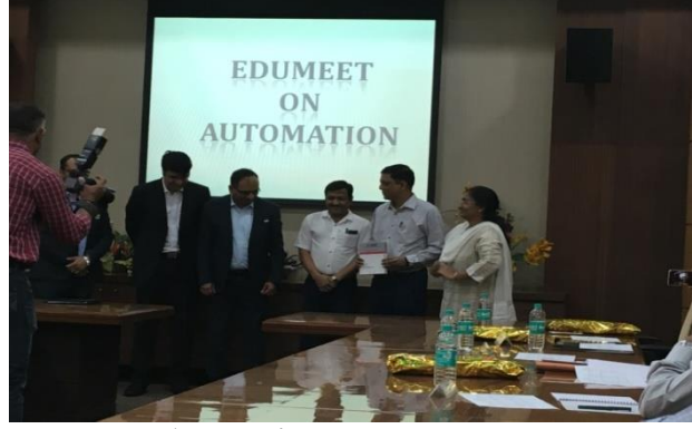
Edumeet on Automation at IIT Bombay