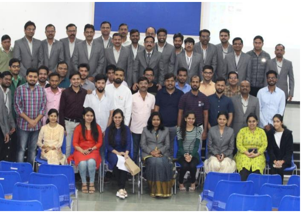
Department of Mechanical Engineering