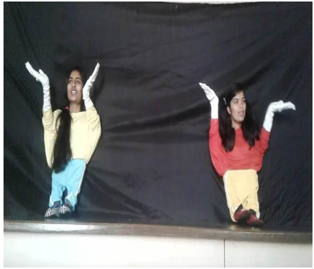
The cultural event of KBTCOE-Fusion 2K19 was carried out during 21<sup>st</sup> to 26<sup>th</sup> January 2019. Students from various departments showcased their talent and skills during the event.