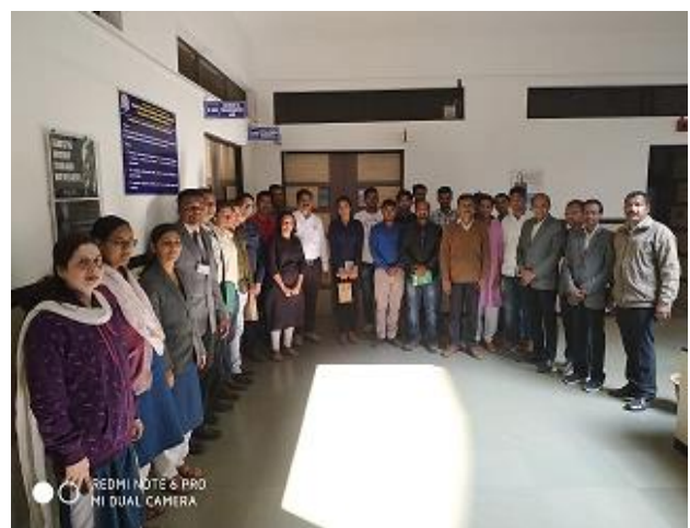
Department of Instrumentation & Control Engineering