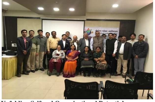
Unfolding Self and Organizational Potential