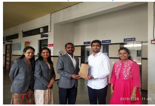
Department of Information Technology