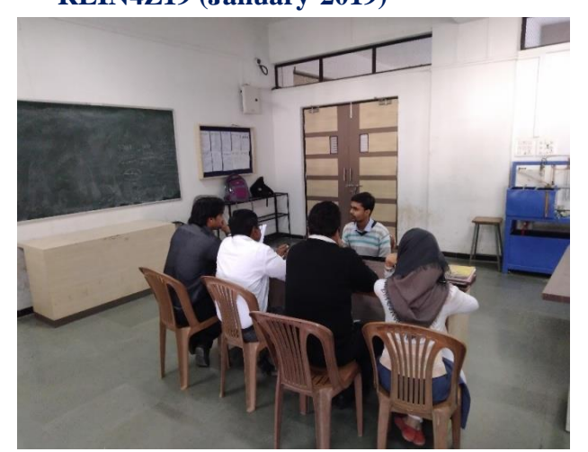
The department arranged a one-day event - REIN4Z19 on 17<sup>th</sup> January 2019. The CESA committee of department successfully conducted this event which included three competitions: Reinforcement, Mock Interview and Photography.