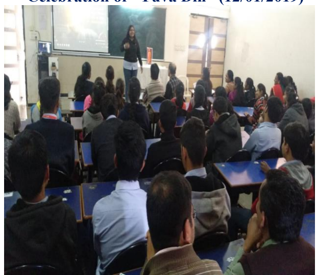
The staff members and students of E & TC department celebrated the birth anniversary of Swami Vivekanand and Rajmata Jijau on the occasion of Yuva Din on 12<sup>th</sup> January 2019