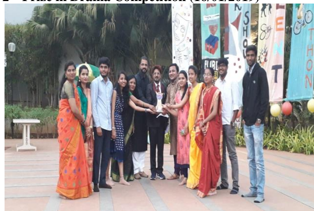
Students of TE-Civil participated in NUKKAD drama competition held at MET BKC, NASHIK on 16^{th} January 2019. The team won the 2^{nd} Prize.

2<sup>nd</sup> Prize in Drama Competition (16/01/2019)