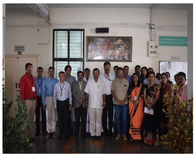
One day workshop on "Syllabus Discussion and Implementation on Process Instrumentation"