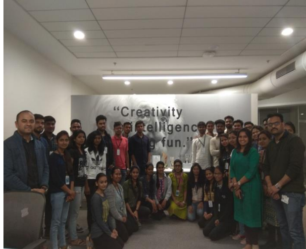
An Industrial visit to Digital Impact Square, Nashik was organized for students of MBA-FY on 19<sup>th</sup> January 2019