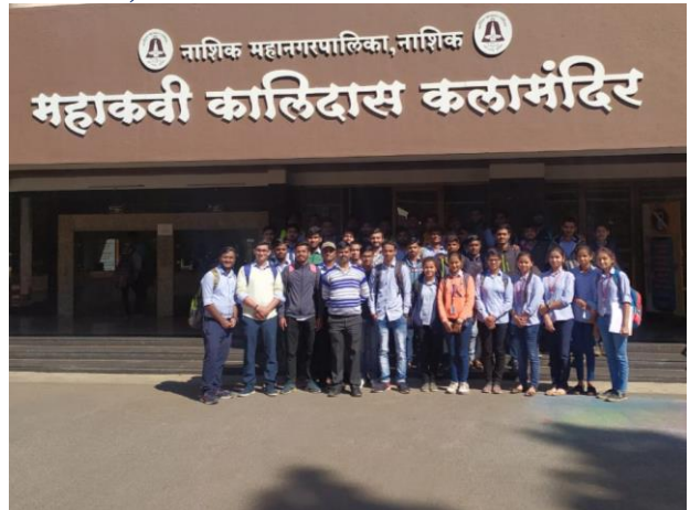
A visit to Central air Conditioning plant of auditorium of Kalidas Kalamandir was organized for Third Year Mechanical engineering students under the subjects Refrigeration and Air Conditioning on 16<sup>th</sup> & 17<sup>th</sup> January 2020.

Central air Conditioning plant of Kalidas Kalamandir (16<sup>th</sup> -17<sup>th</sup> January 2020)