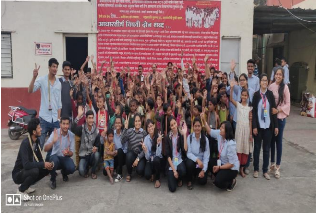
PAES-E&TC along with its staff visited Adhartirtha Ashram on 4<sup>th</sup> February 2019.