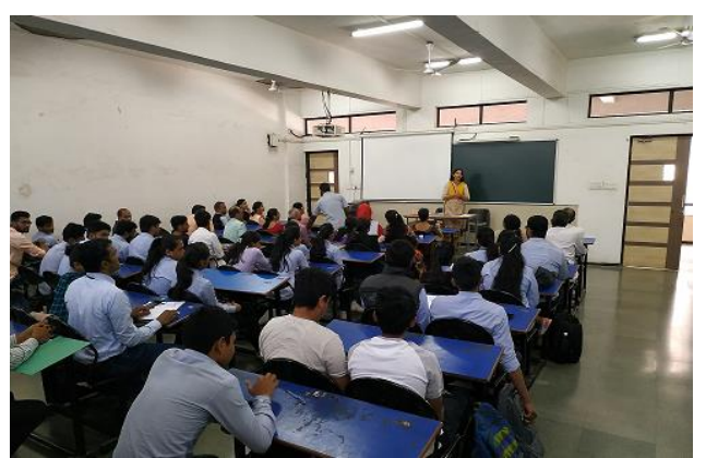
"Women-Centric Families" was the topic of Expert talk in Parents Meet in Department of Instrumentation & Control Engineering on 23<sup>rd</sup> February 2019.