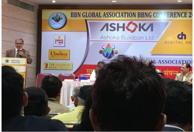
Conference of Entrepreneurs, Thane