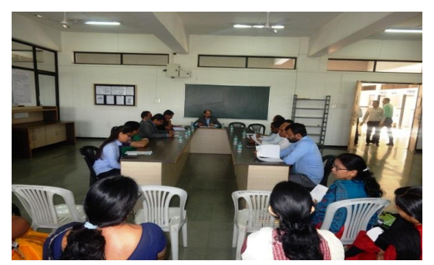
As a part of OBE (outcome based education) & to bridge the gap between industry and institute, a second meeting of Industrial Advisory Board & Stack Holder was held on 23<sup>rd</sup> February 2019 to discuss various issues to achieve & implement OBE at Department of Electronics & Telecommunication Engineering.