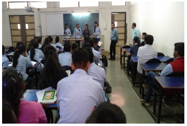
PAES-E&TC organized an interactive session of "Industry Placed Students through Campus" with SE & TE students on 13<sup>th</sup> February 2019.

Interactive session of "Industry Placed Students through Campus" (13/02/2019)