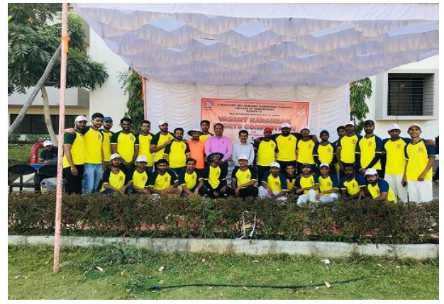
Students of Final year Instrumentation & Control engineering participated in sports events like Cricket, Volleyball & Football in Vasant Karandak 2019.