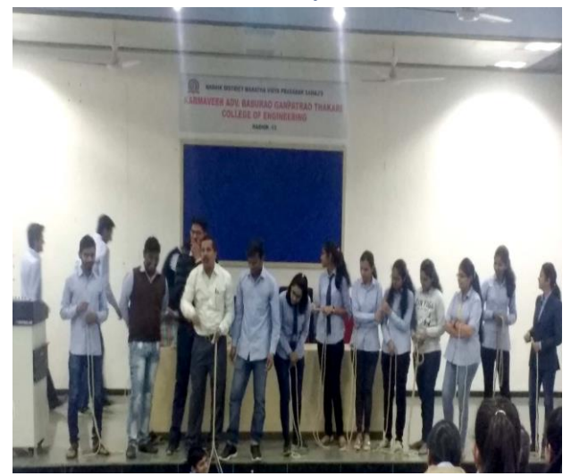
A Two Days Workshop on Disaster Management funded by the SPPU is conducted in college on 21<sup>st</sup> & 22<sup>nd</sup> February 2019. Six Students from the E & TC Department were participated in the Workshop.

Workshop on Disaster Management (21st – 22nd February 2019)