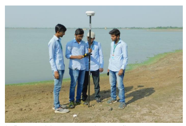
A 5- Day visit was organized at Sukhana Dam to collect the data with the help of DGPS instrument. Total 885 readings were recorded in DGPS instrument at various points. Daily data was backed up in computer for uploading in Trimble Business Centre software which uploads data directly on Google earth software to get reference for further work.