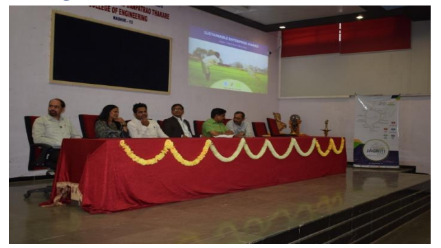
Third Year Instrumentation & Control Engineering students attended value added session on "Creating Awareness on Sustainable Entrepreneurship Award" by Jagriti Yatra on 28<sup>th</sup> March 2019.