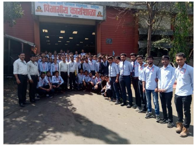
A Visit to ST workshop was organized for Second Year Mechanical engineering students under the subjects Theory of Machines and Applied Thermodynamics on 5<sup>th</sup> & 6<sup>th</sup> March 2019.

• "ST workshop" (5<sup>th</sup> – 6<sup>th</sup> March 2019)