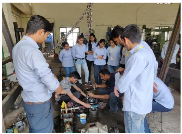
Third year students of the department visited, Shri Krishna Gears Ambad Nashik for the practical knowledge of subject Design of Machine Elements – II on 28<sup>th</sup> March 2019.

"Shri Krishna Gears Ambad Nashik" (28/03/2019)