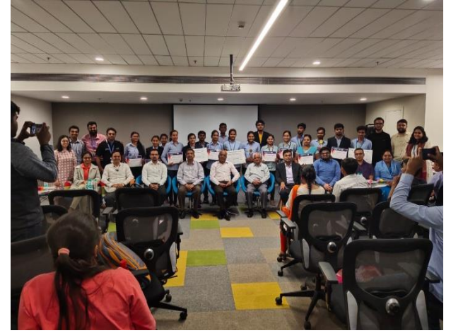
CSI organizes regional level project competition every year. From Department of Information Technology, total 7 groups were participated in competition this year. One of the IT project group got 2nd Runner up award by DISQ for the project title "IT Enabled Smart Farming".

Regional Project Competition (16/03/2019)