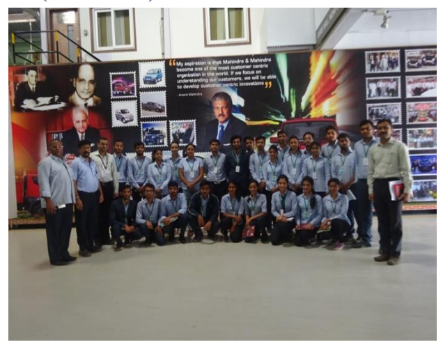
The department organized an industrial visit to Mahindra & Mahindra Ltd, Nashik on 28<sup>th</sup> March 2019. Students observed manufacturing automation and robotics during the visit.