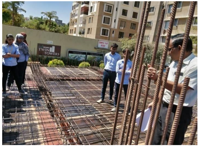
On 21<sup>st</sup> March 2019, TE Civil students have visited a residential site of Karda Constructions near Vishwas Lawns, Nashik. In this visit they observed reinforcement placing in various components of building like slab, beam, column etc. as per drawing provided by the structural designer.