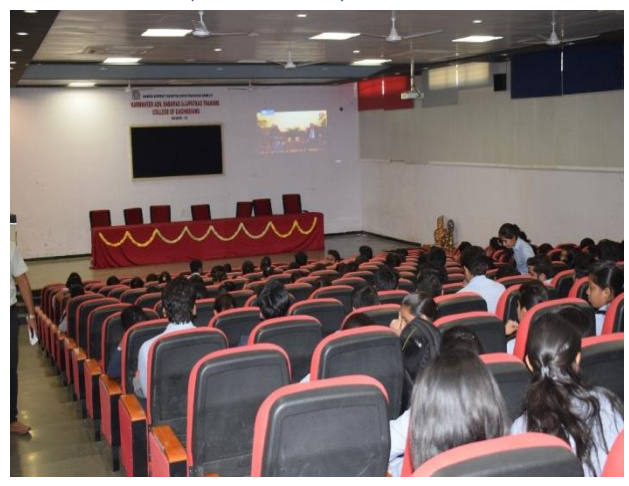
Staff and students of Department of Instrumentation & Control attended a live webinar by Shri. Ajit Doval (National Security Advisor, Govt. of India) under Institutions' Innovation Council (IIC) on 19<sup>th</sup> March 2019.