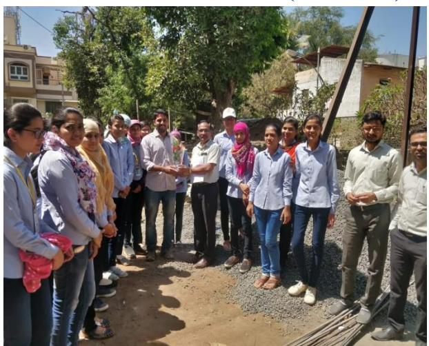
On 21<sup>st</sup> March 2019, TE Civil students have visited a residential site of Kulkarni Constructions near Rajiv Gandhi Bhavan, Nashik.