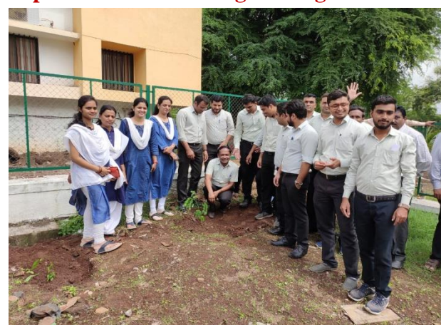
Staff members of Civil Engineering department participated in Tree Plantation Activity