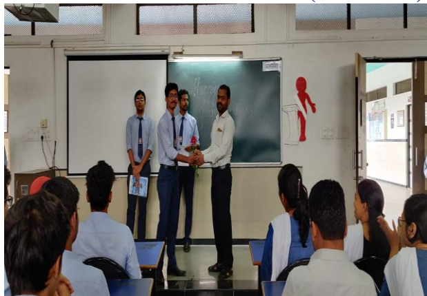
Information Technology Student Association (ITSA) students celebrated "Guru Pournima" and also introduced newly elected ITSA members on 16 th July, 2019.