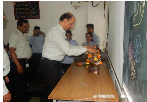
The students of Electronics and Telecommunication Engineering department organized Guru Pournima Program on 23 rd July 2019.