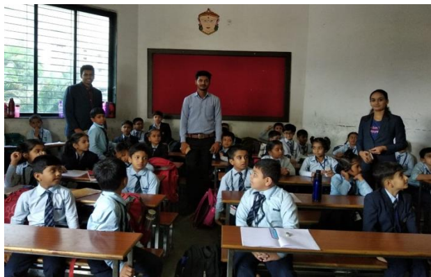
Students of MBA are carrying out Raakhi Making workshops at various schools in Nashik under Project Bandhan