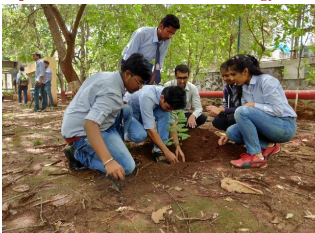
A Tree Plantation program was organized by KBTCE NATURE CLUB student & staff members.