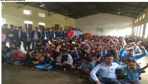
Students of MBA also visited an Ashram Shala (Residential School) at Thanapada which is a tribal area to carryout workshops under Project Bandhan